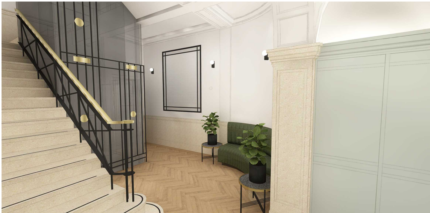
2 Proposed Visual