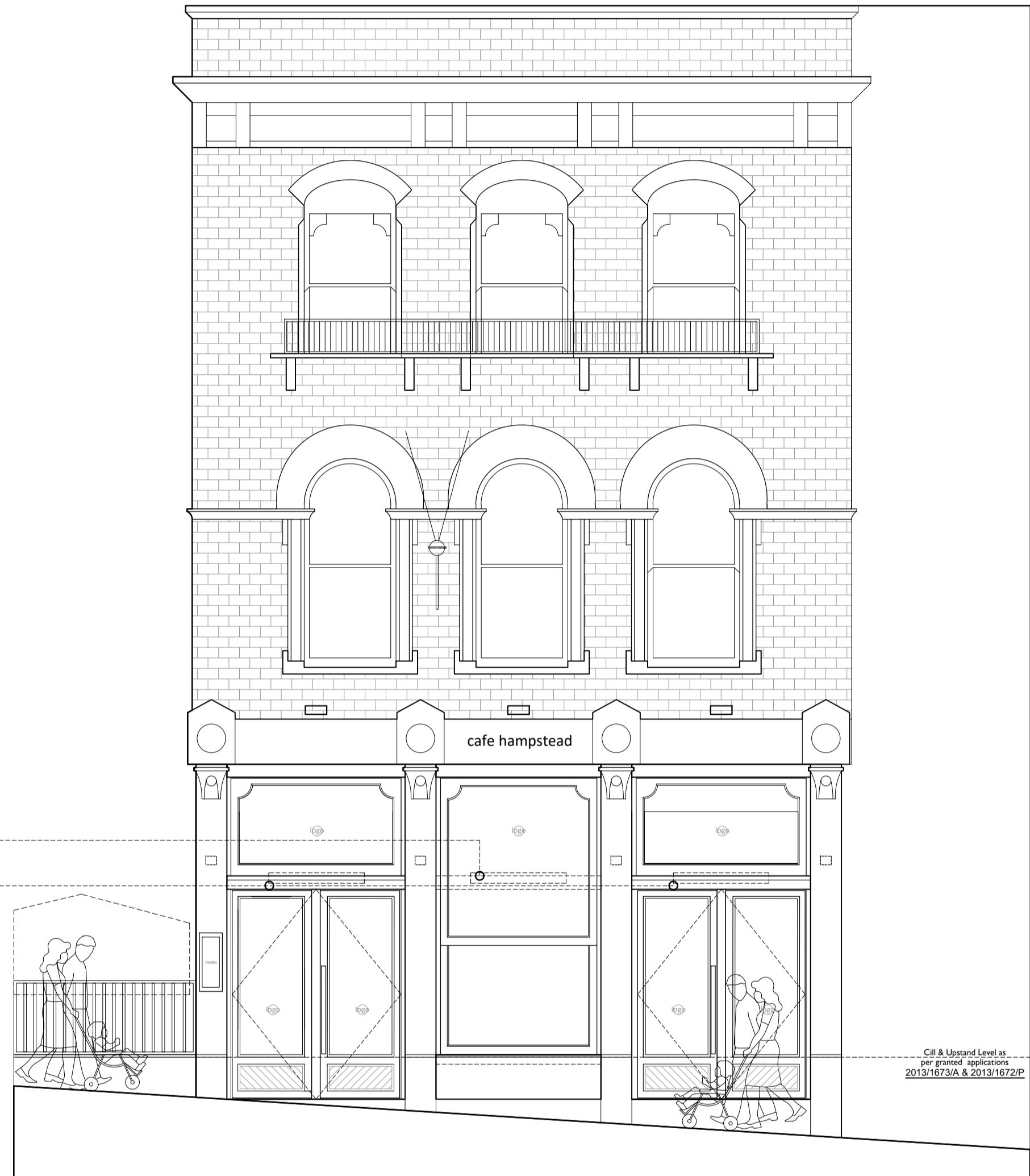
0m 0.5m 1m 2m existing elevation to rosslyn hill 2013/1673/A & 2013/1672/P