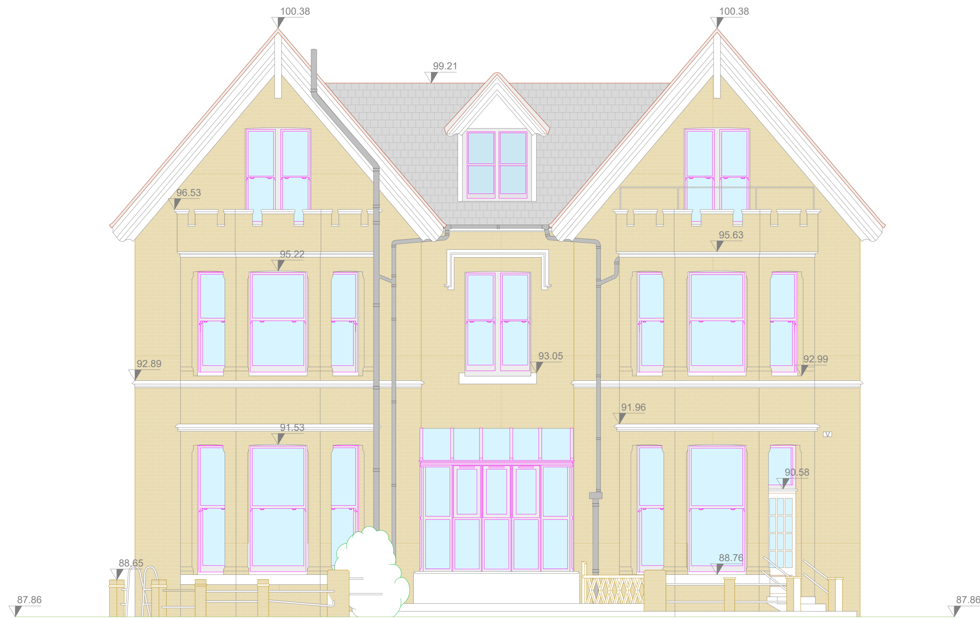
Proposed Elevation 4