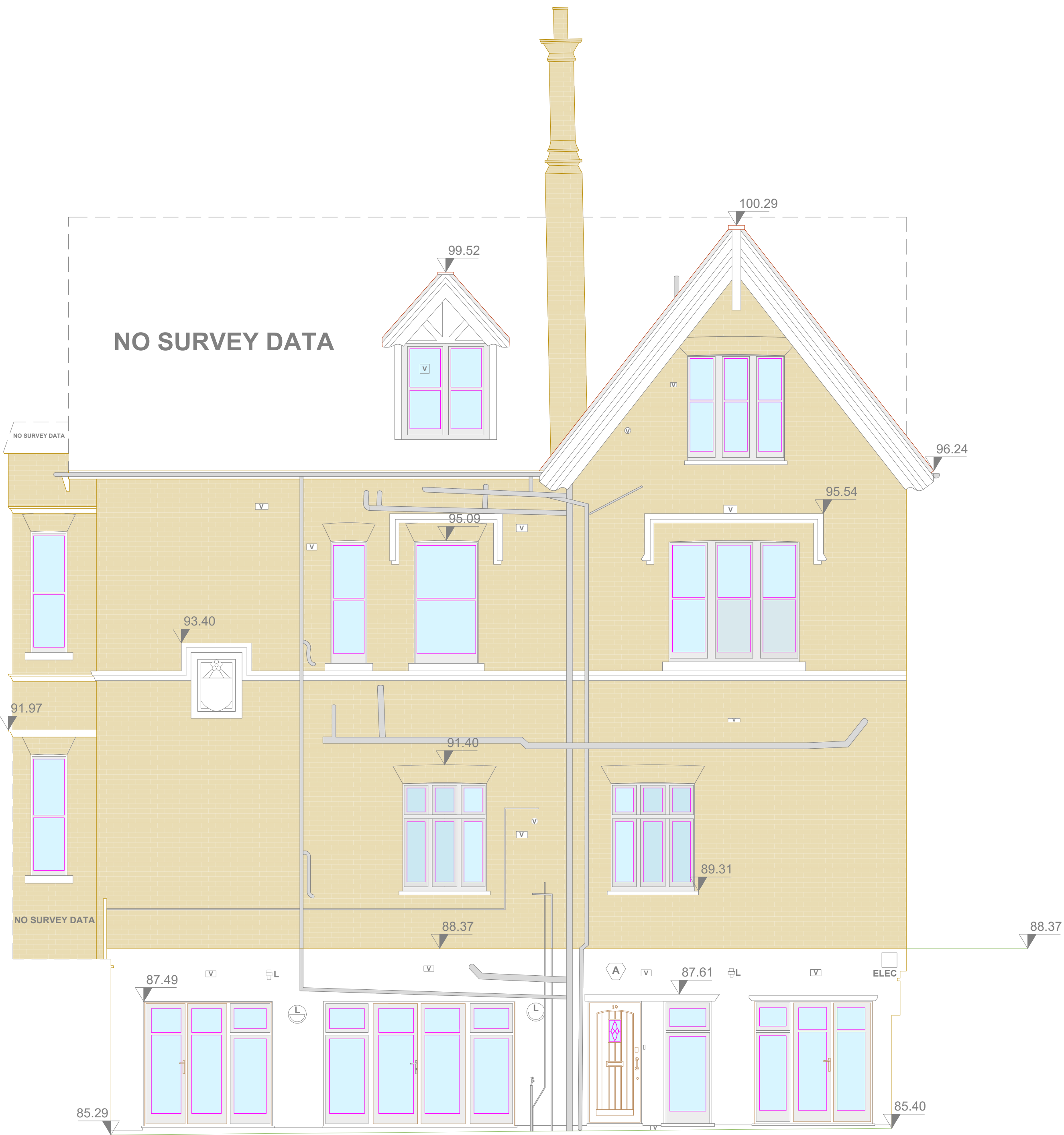
Existing Elevation 5