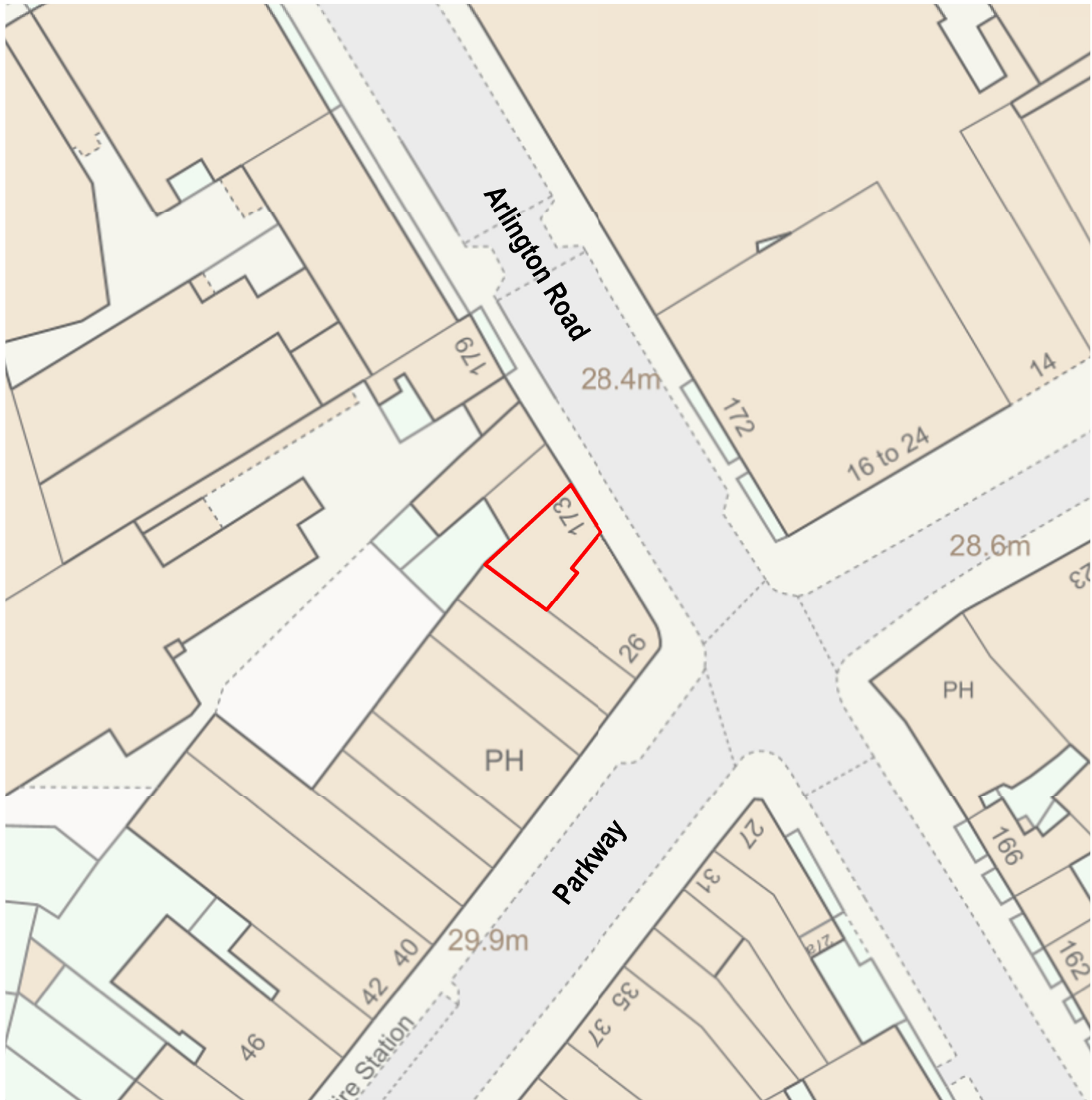
BLOCK PLAN 1 : 500 @A3