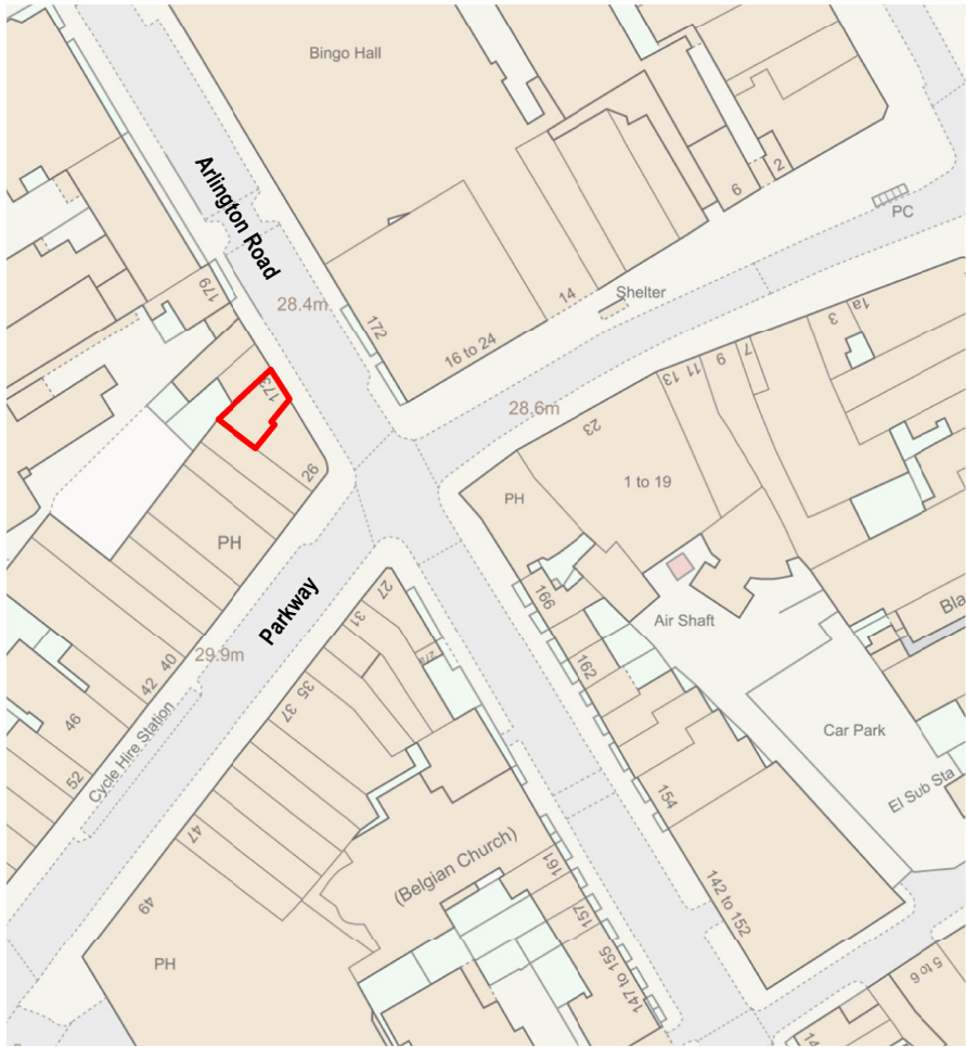
LOCATION PLAN 1 : 1250 @A3