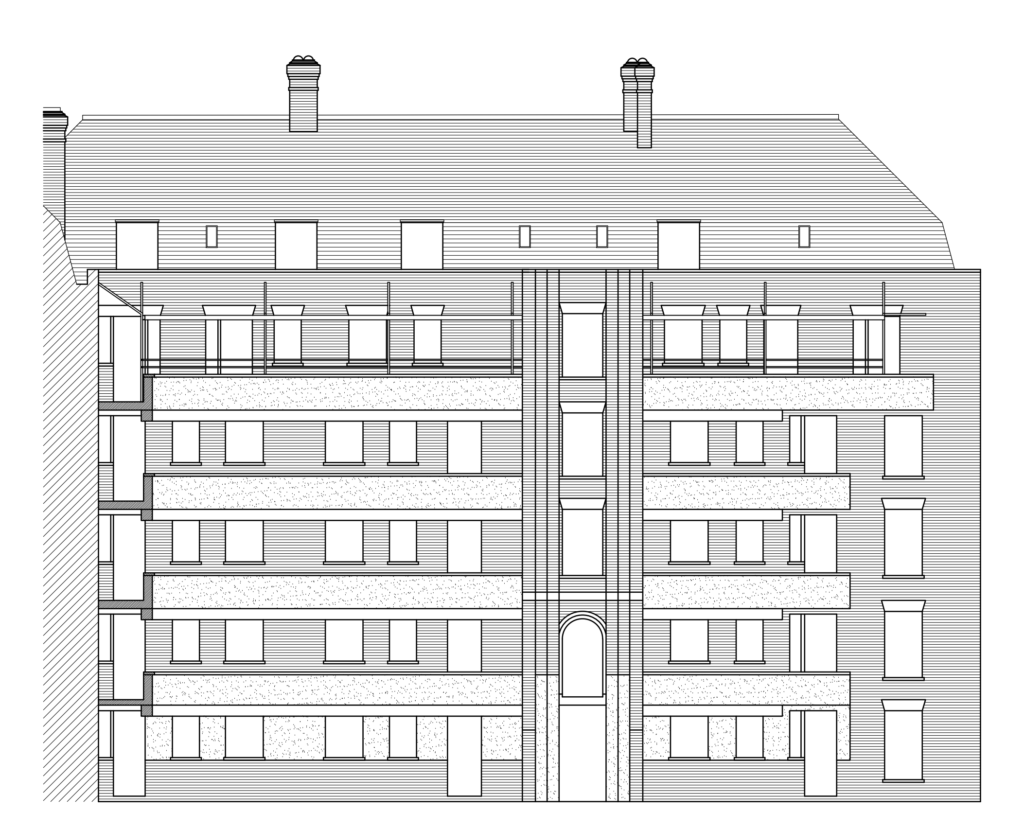
ELEVATION C - AS EXISTING

Report all discrepancies, errors and omissions Do not scale from this drawing. Verify all dimensions on site before commencing any work or preparing shop