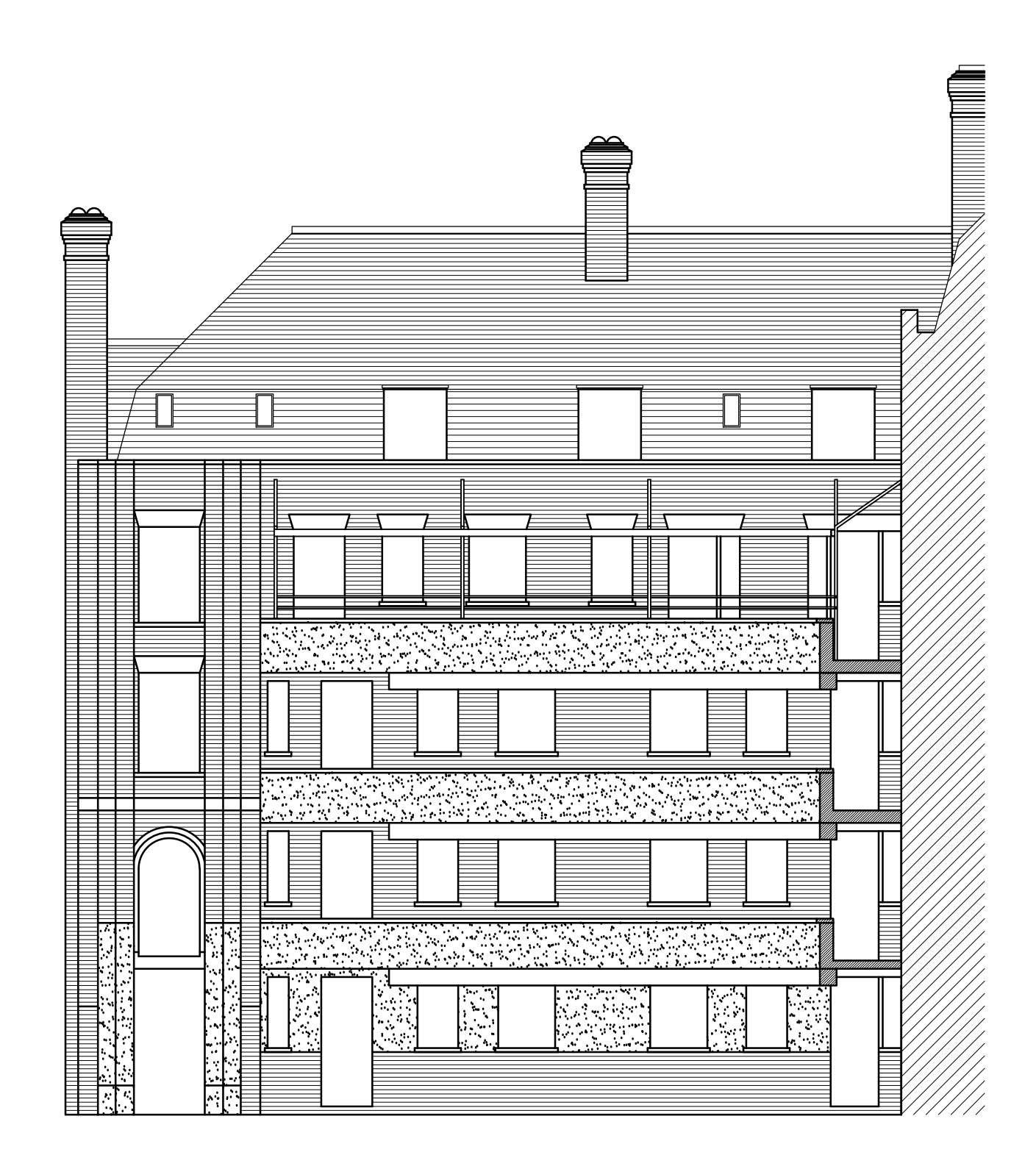
ELEVATION A - AS EXISTING