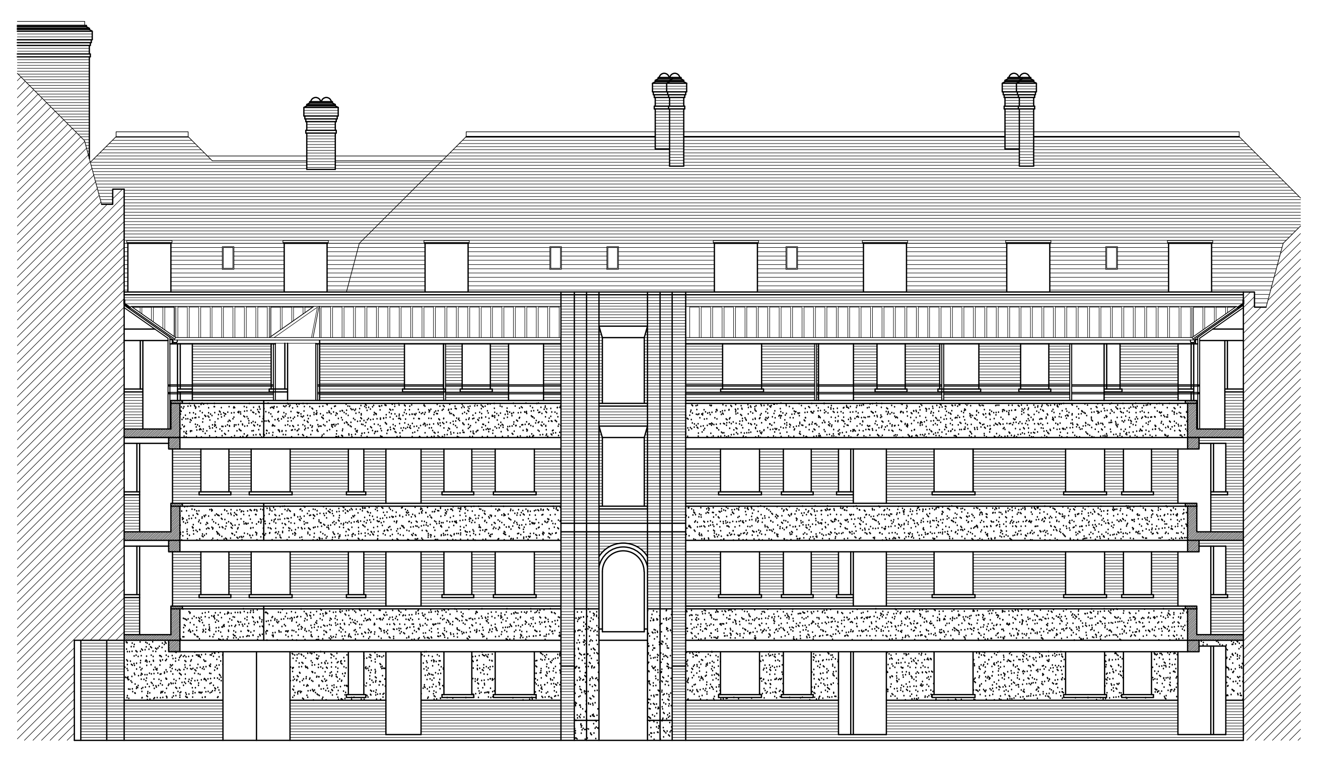
ELEVATION F - AS PROPOSED