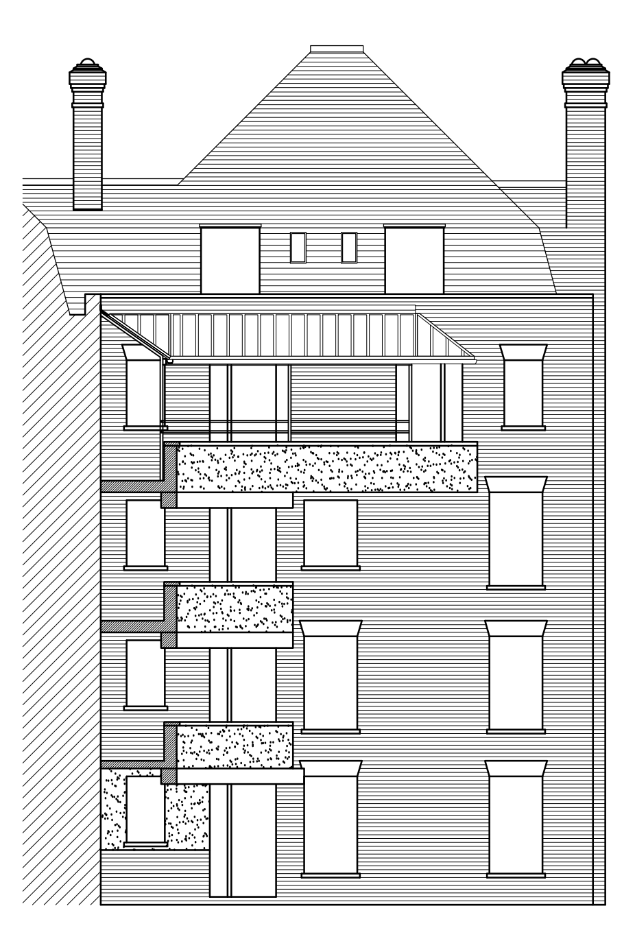
ELEVATION G - AS PROPOSED