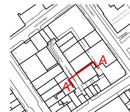
KEY PLAN - NOT TO SCALE

This drawing contains critical information in colour. To ensure this information is legible, only print or copy this drawing in full colour.