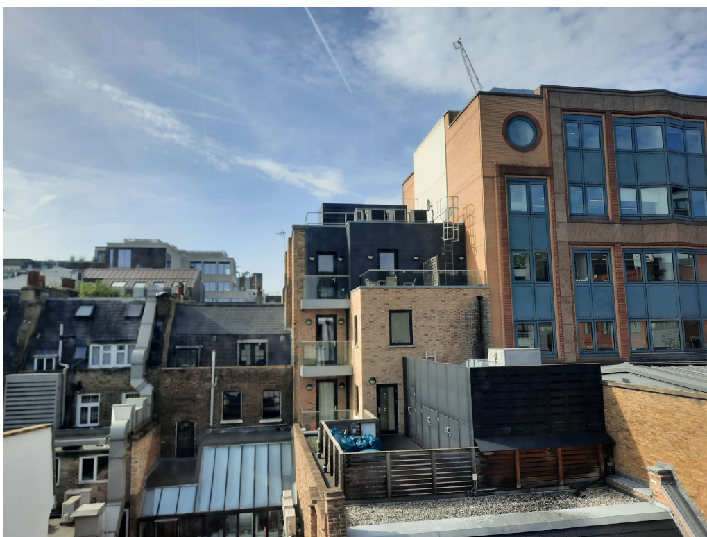
View of roof of buildings to front