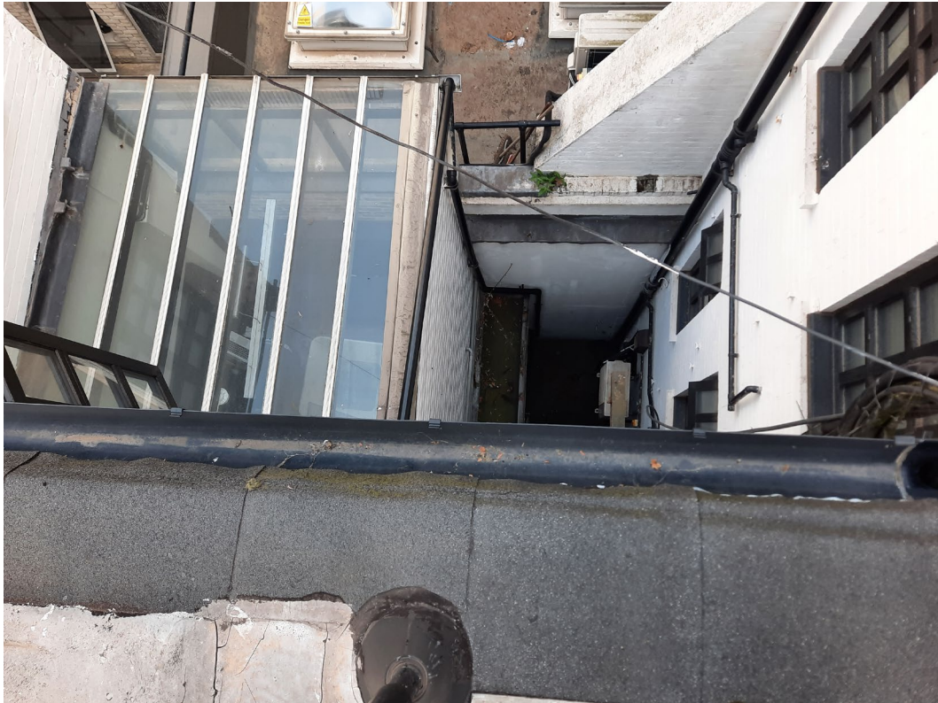
View of roof of buildings to rear