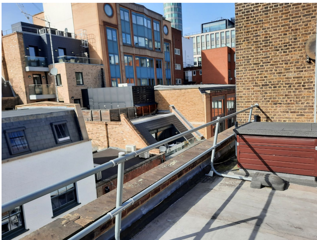
View of roof and buildings to front