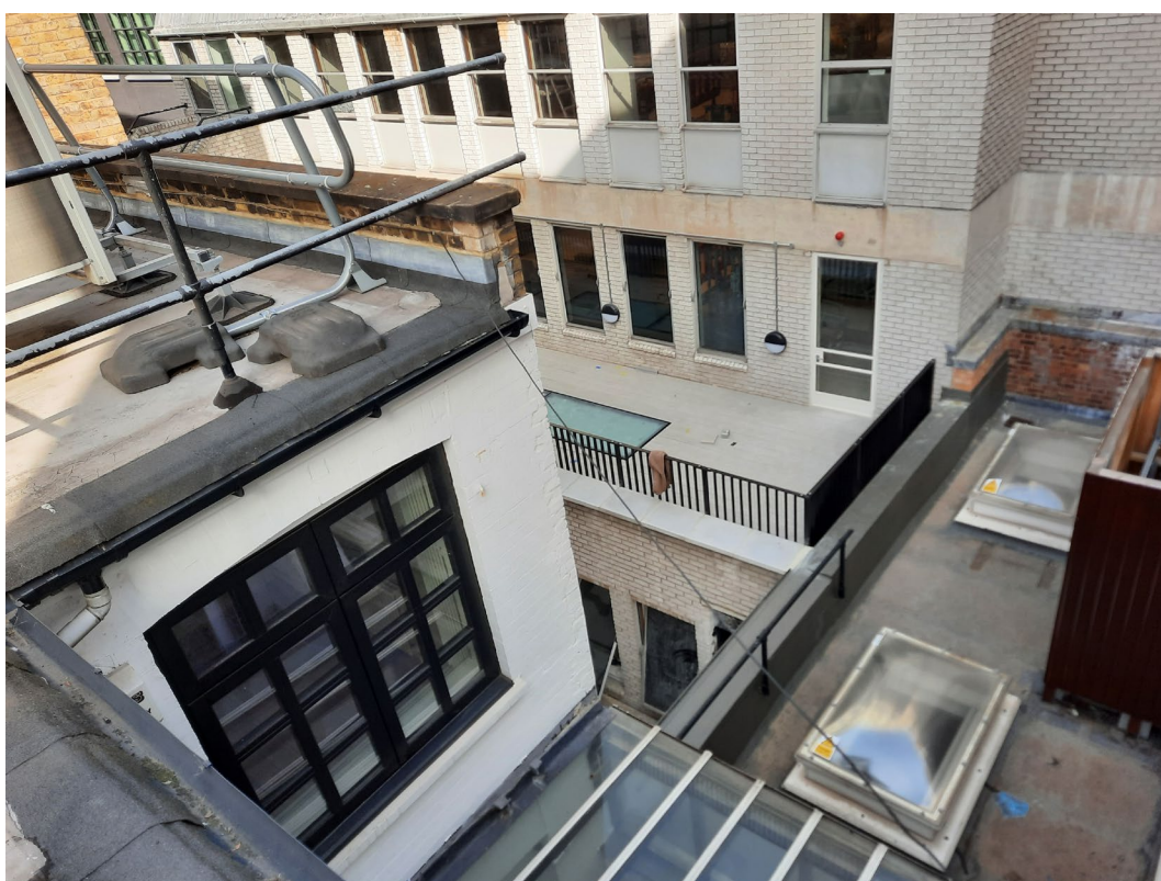
View of roof of buildings to rear