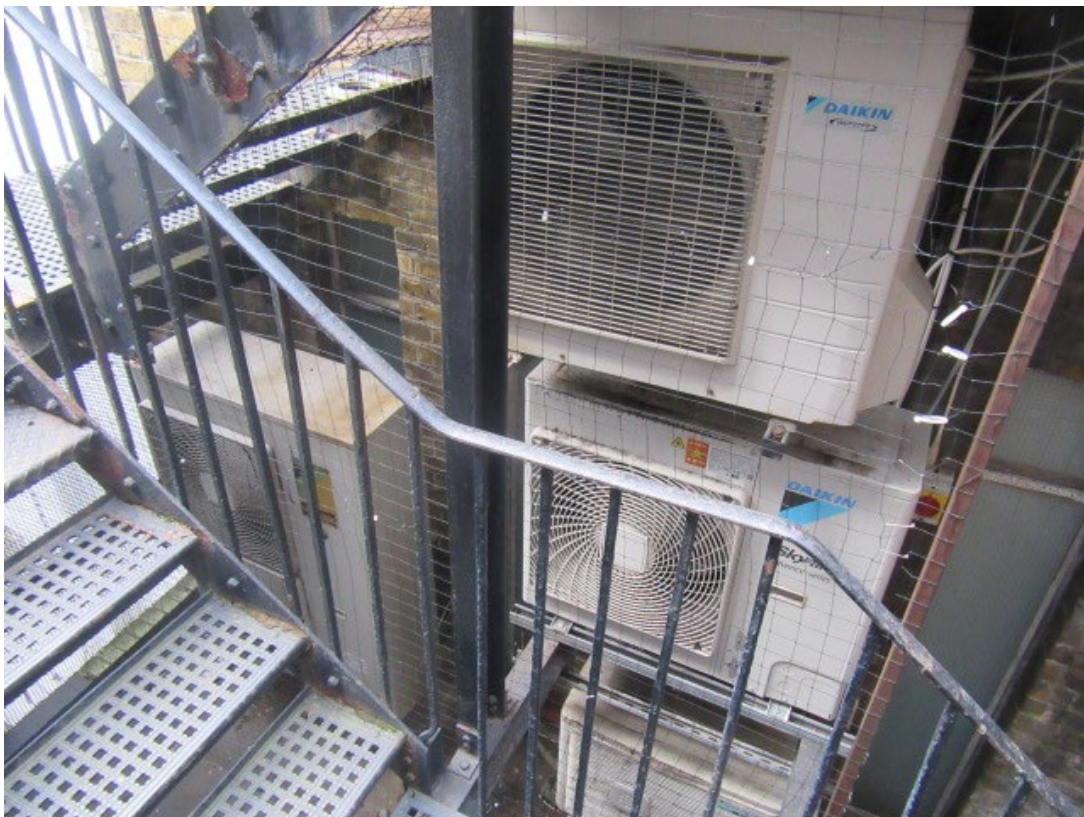
View of No.6 A/C Units to be removed