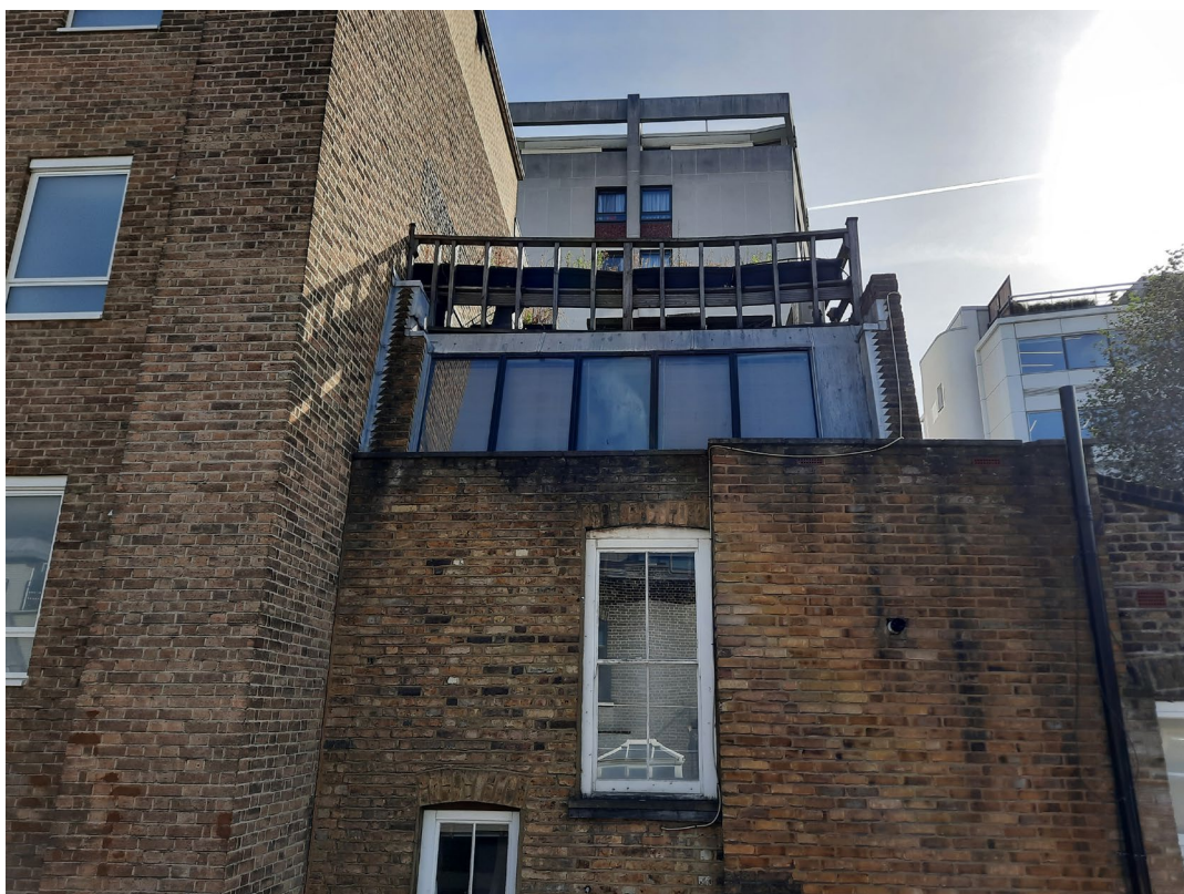
View of rear of 26A Tottenham Street