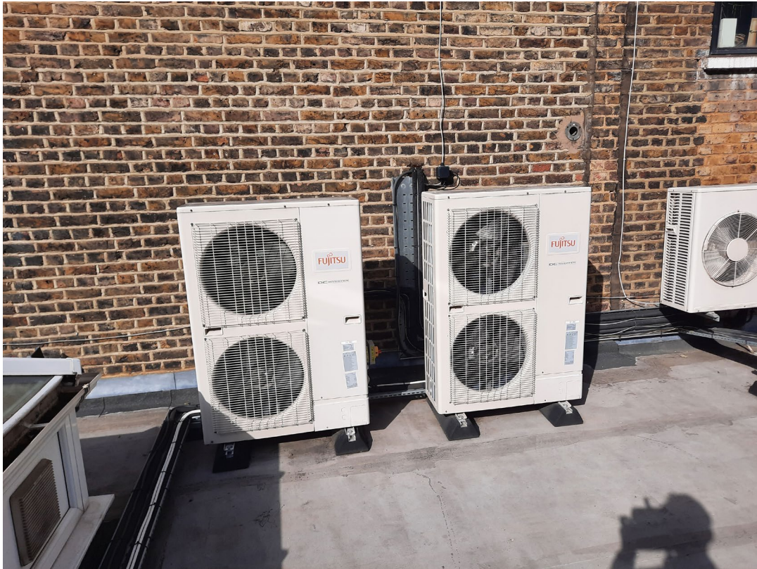
View of 2No. A/C Units to be relocated, and RHS 1 of 2 Units to be removed