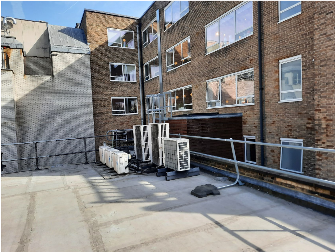
View of No.6 A/C Units to be removed