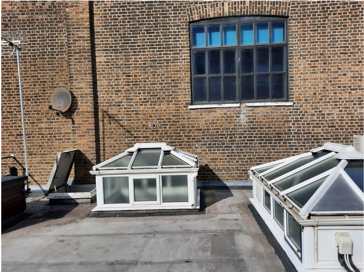
View of existing opening in 9-10 Charlotte Mews to be enlarged for new doors, No.2 roof lanterns, water tank enclosure, roof hatch, TV aerial and satellite dish to be removed