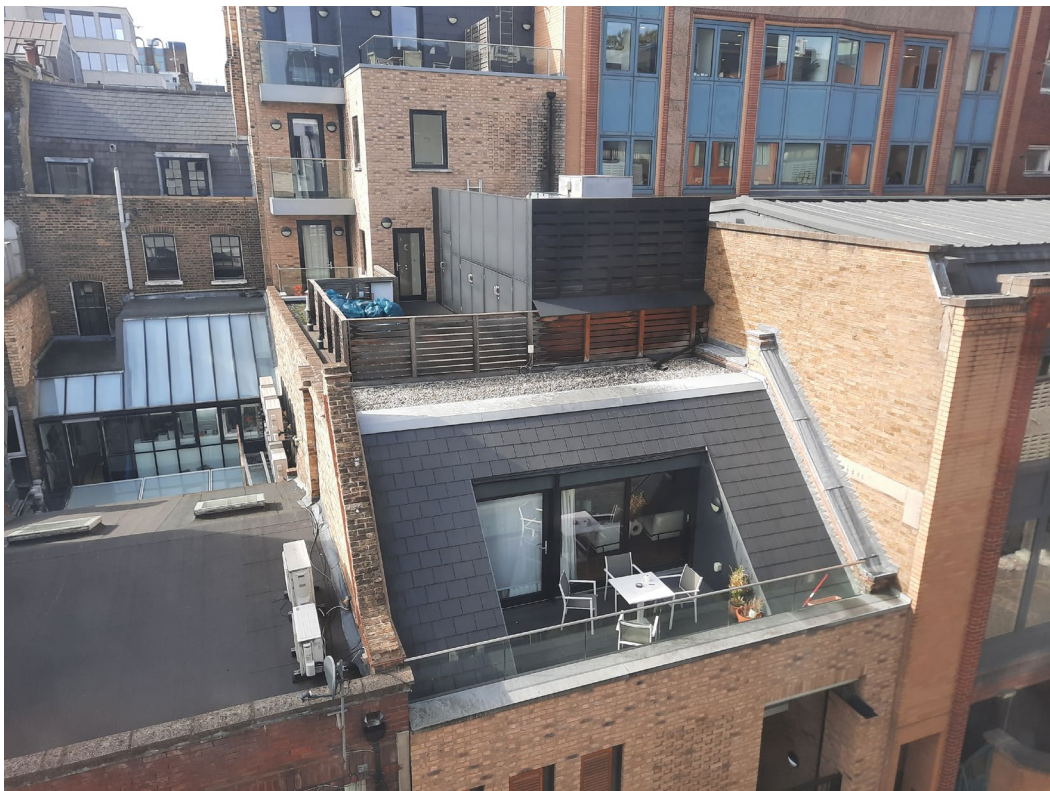
View of roof of buildings to front