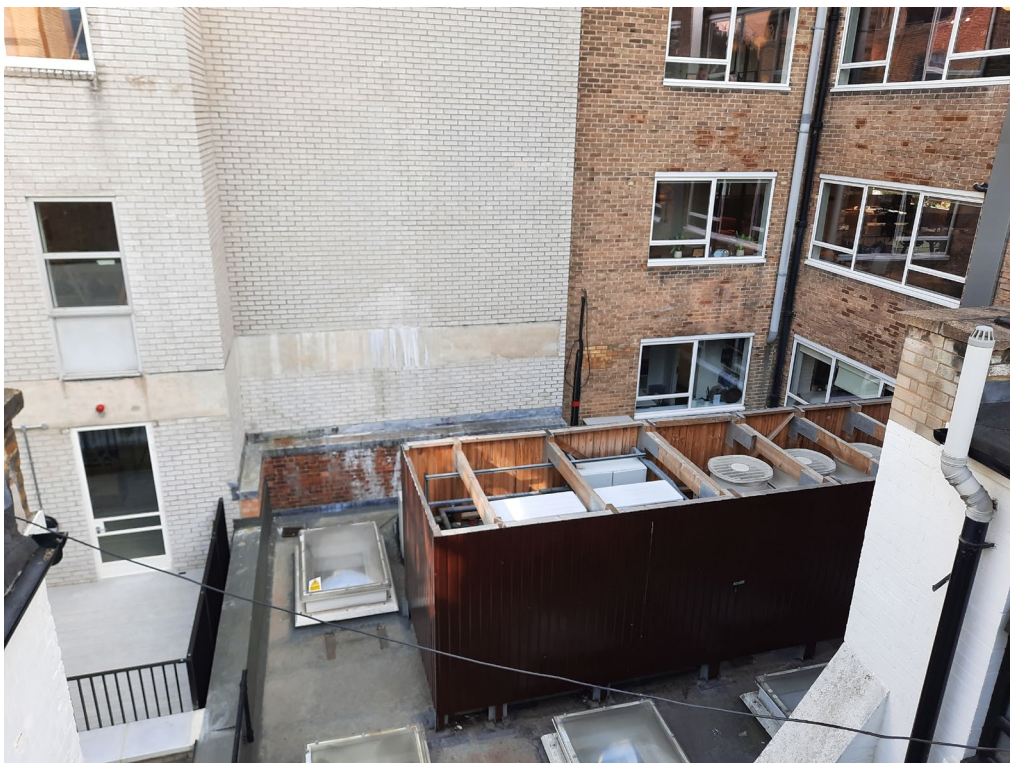
View of roof of buildings to rear