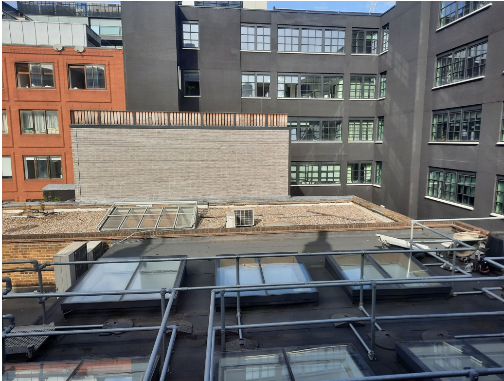
View of roof of adjacent buildings