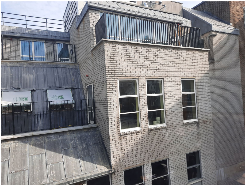
View of adjacent buildings