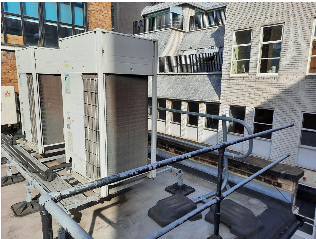
View of No.2 A/C Units to remain