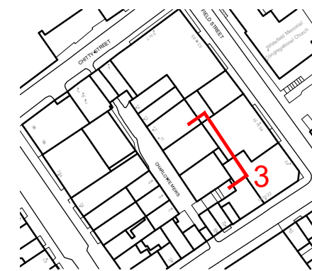
KEY PLAN - NOT TO SCALE