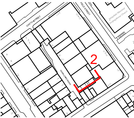
KEY PLAN - NOT TO SCALE