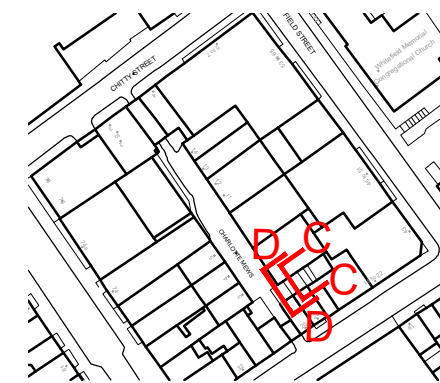
KEY PLAN - NOT TO SCALE