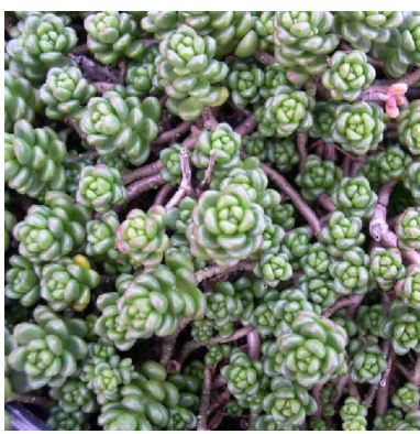
Sedum Album Laonicum