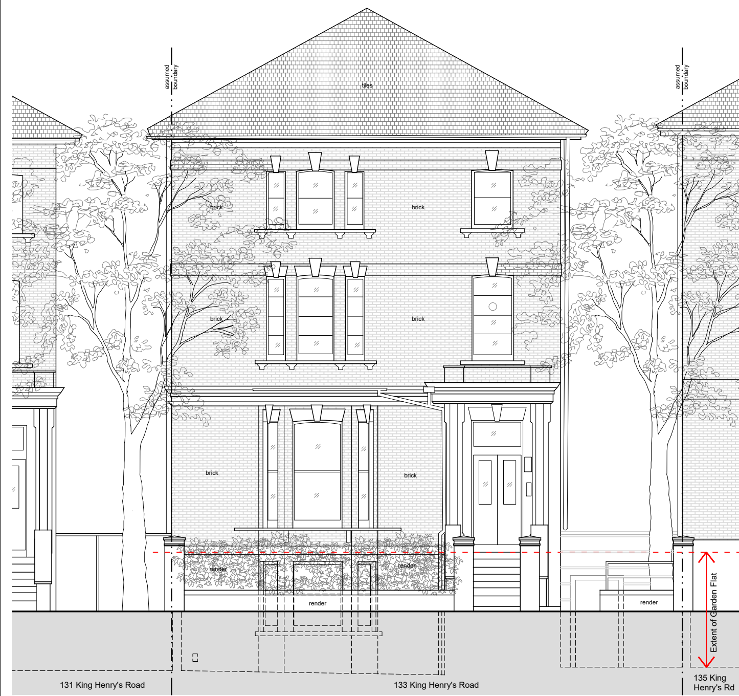
PROPOSED - Street Front Elevation Scale 1:100@A3 PA-03