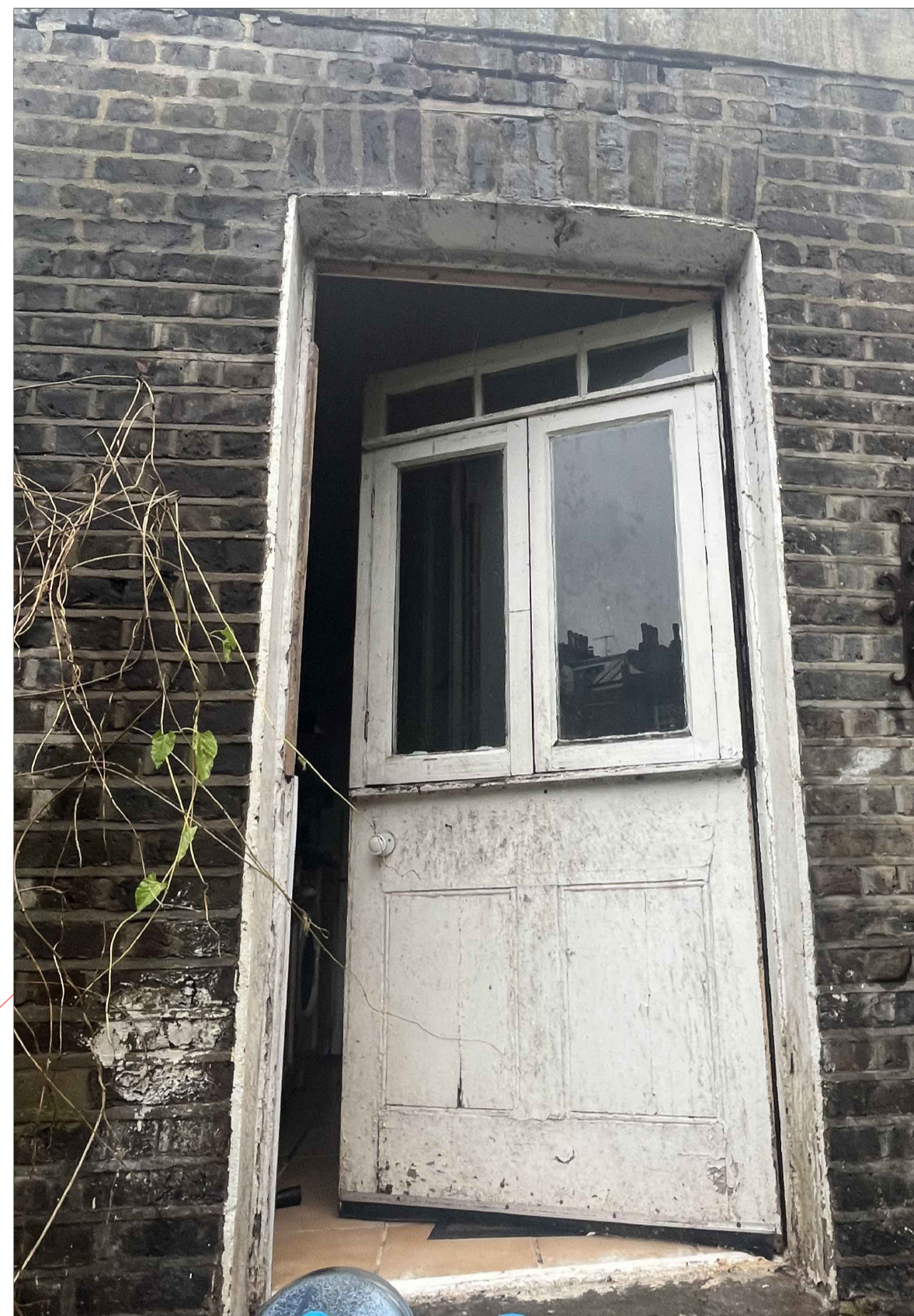
Figure 1 - Image of Existing Door which is to be replaced to match like for like.