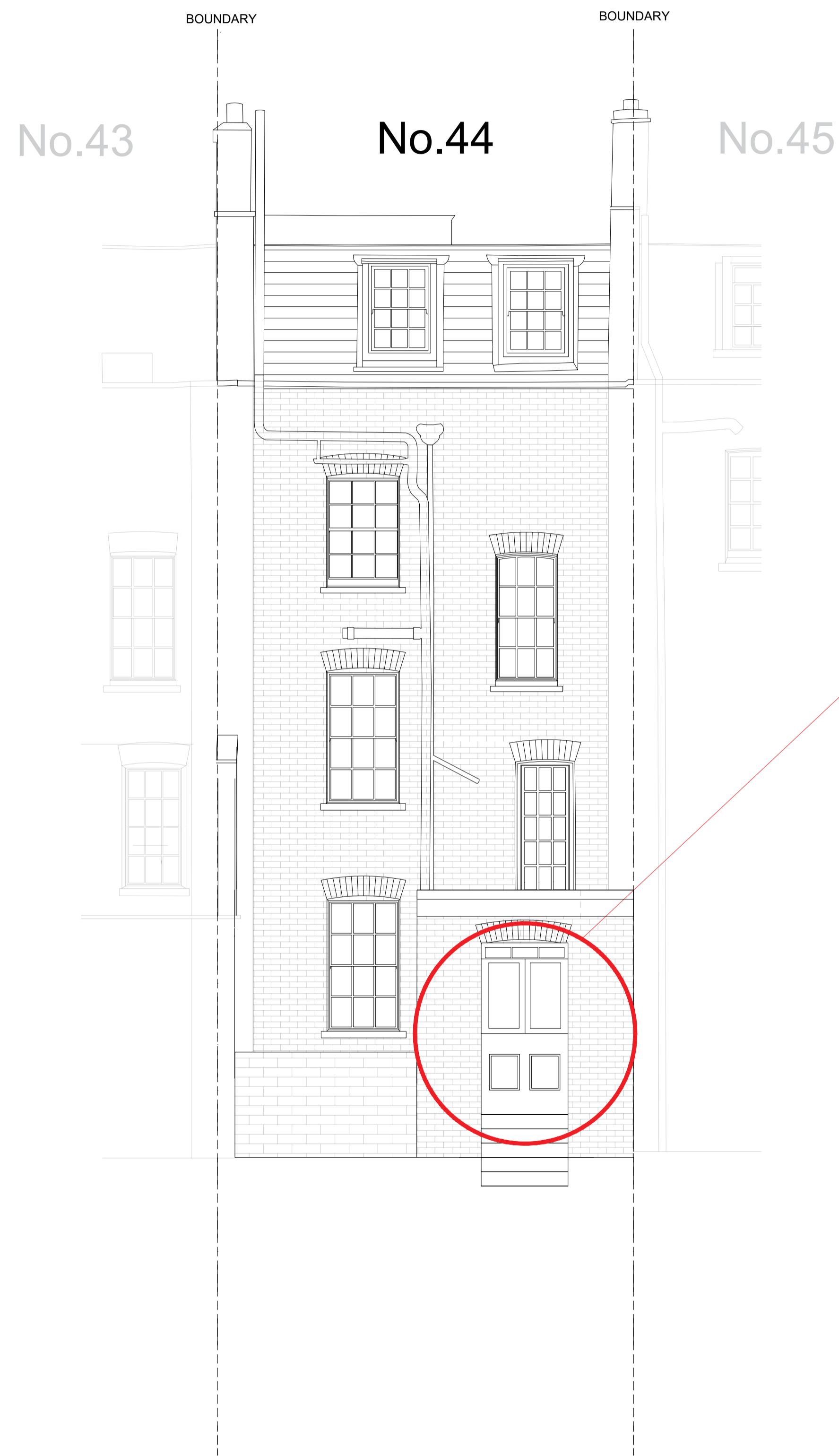
EXISTING ELEVATION | REAR SCALE - 1:50