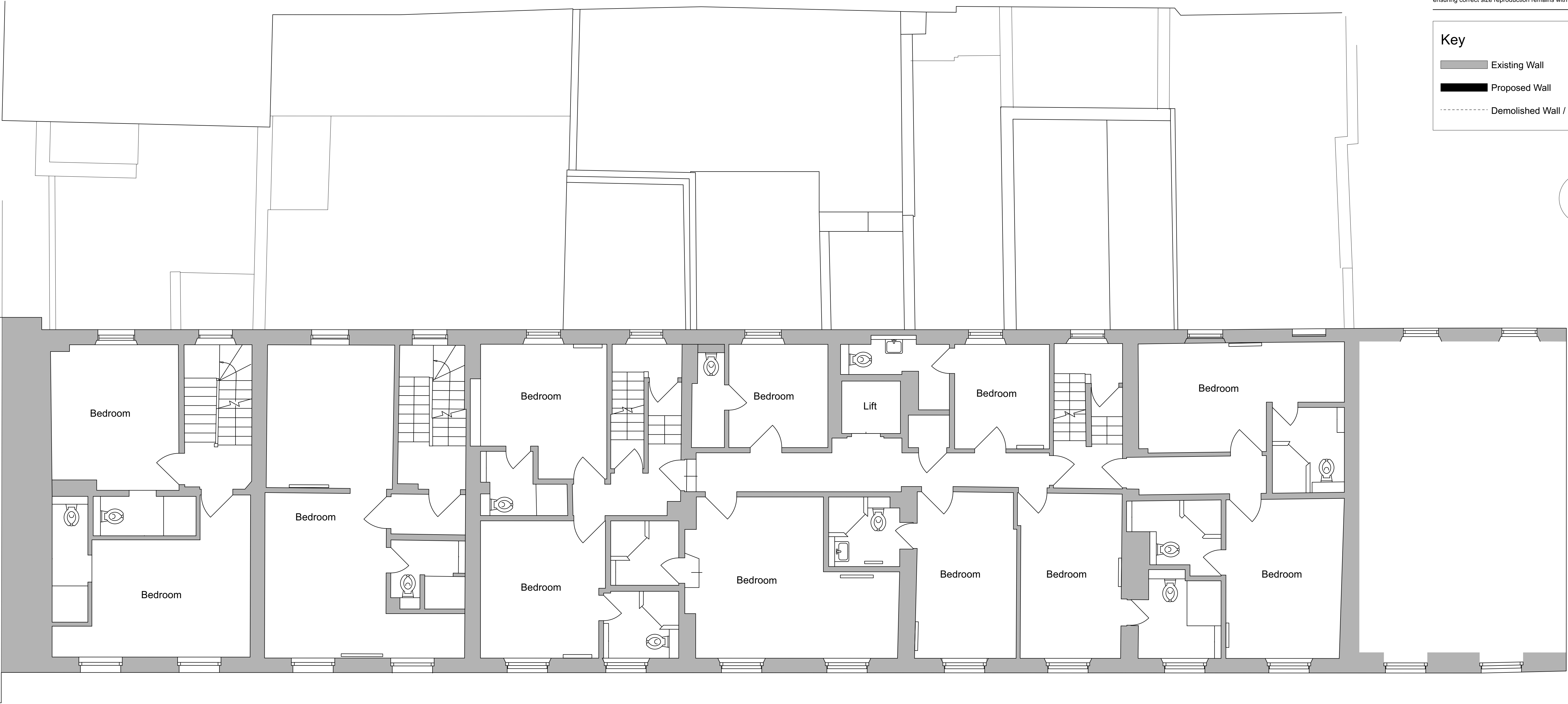
2 Existing Second Floor Plan Scale: 1:50