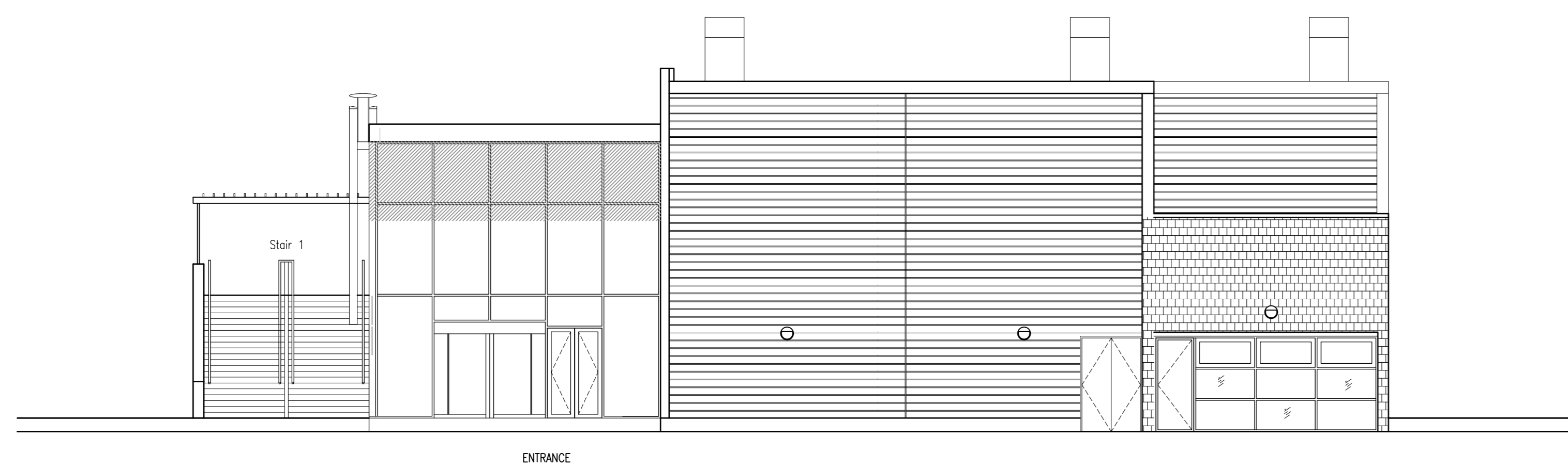
SOUTH ELEVATION. SCALE 1:200