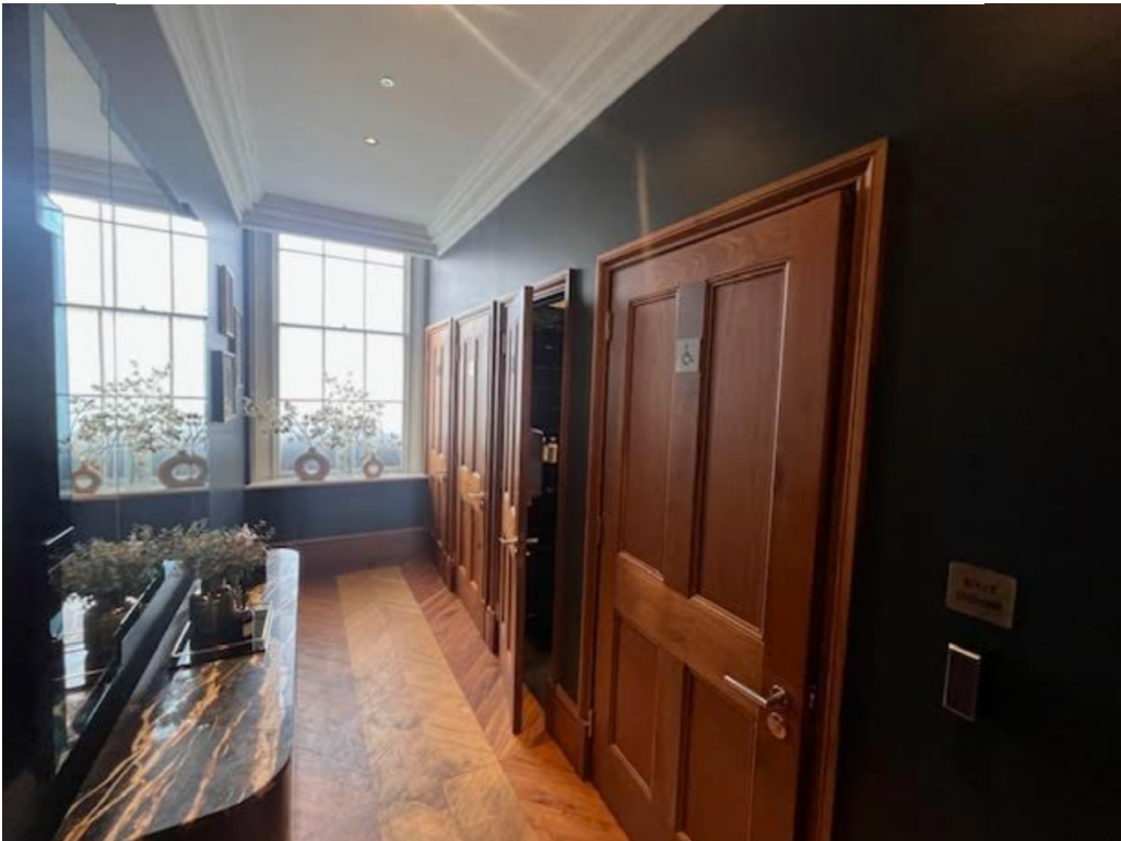
Figure 6: Toilets associated with the first floor lounge