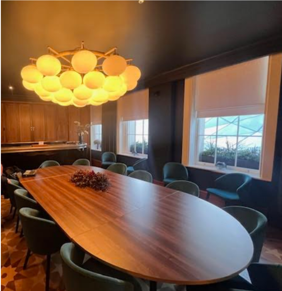
Figure 4: First floor hotel lounge