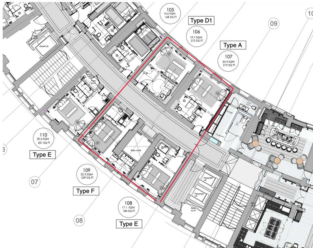
Figure 3: Proposed first floor plan