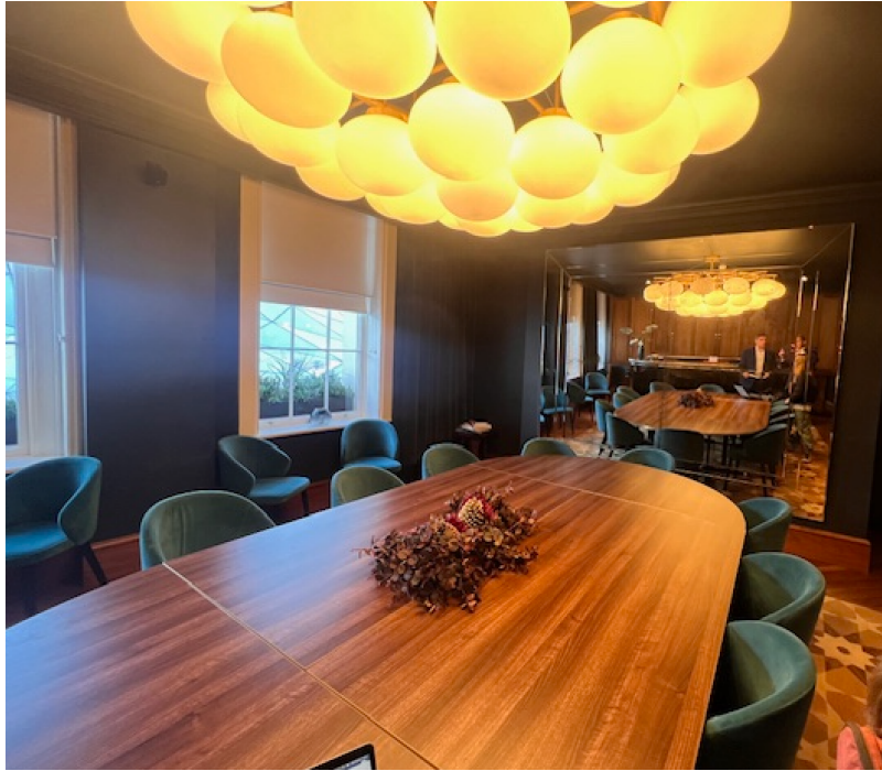
Figure 5: First floor hotel lounge