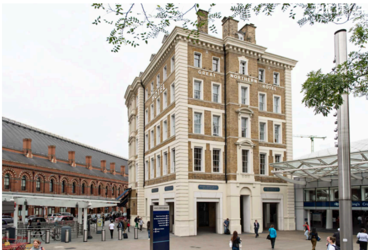
Figure 2: View of Great Northern Hotel from Pancras Road