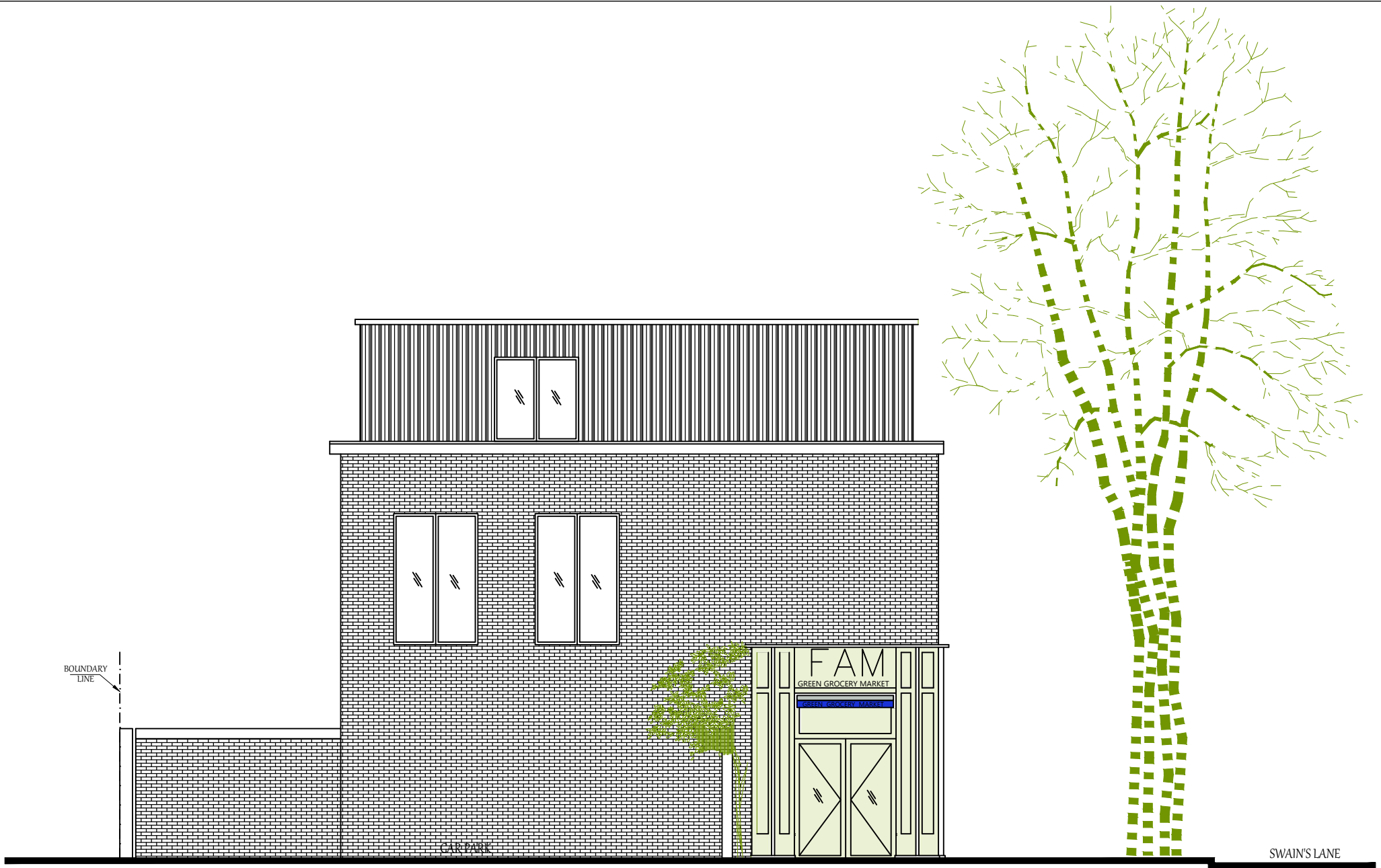
EXISTING SIDE ELEVATION SCALE: 1/100 @A3