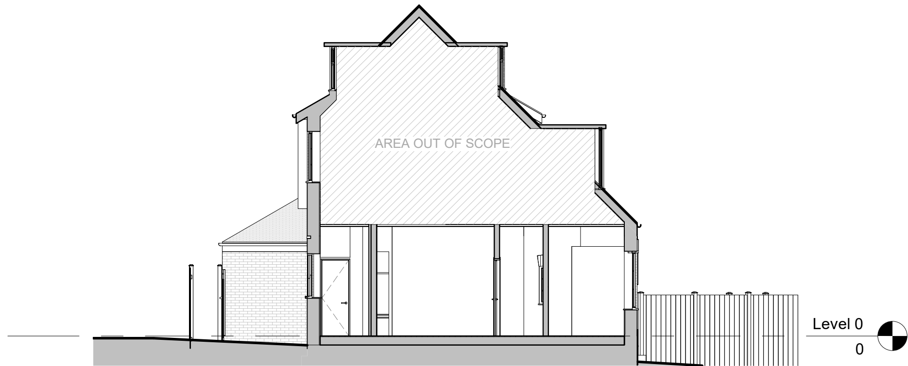
1 S001 Section 1 1 : 100