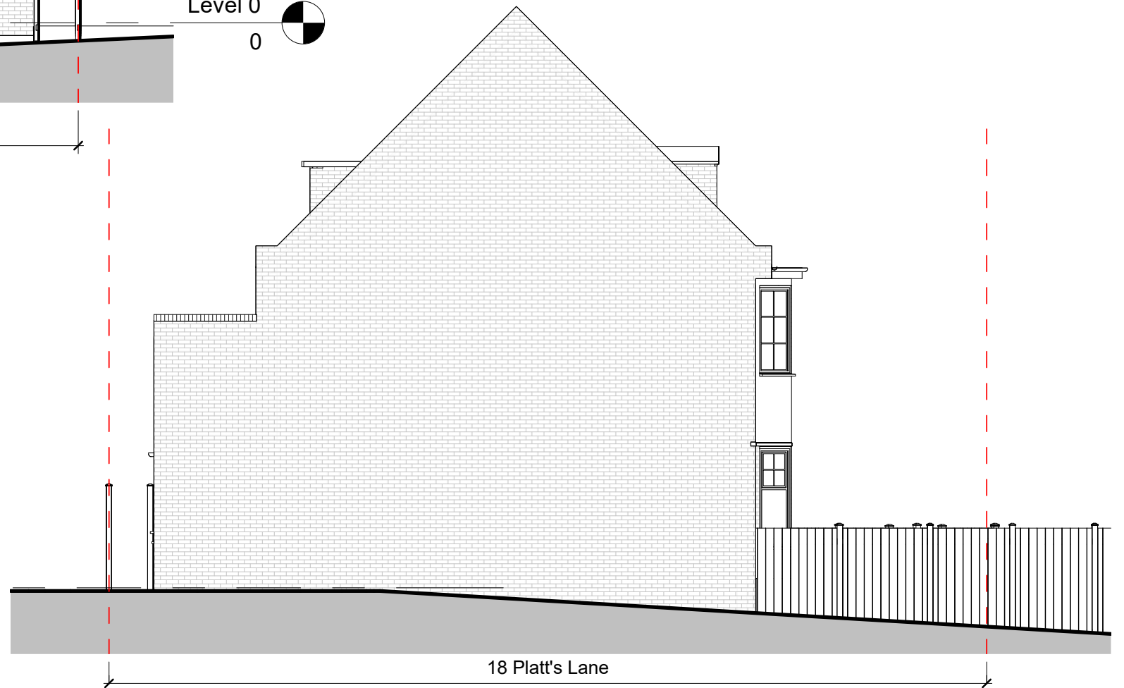
2 E002 SIDE ELEVATION 2 1 : 100