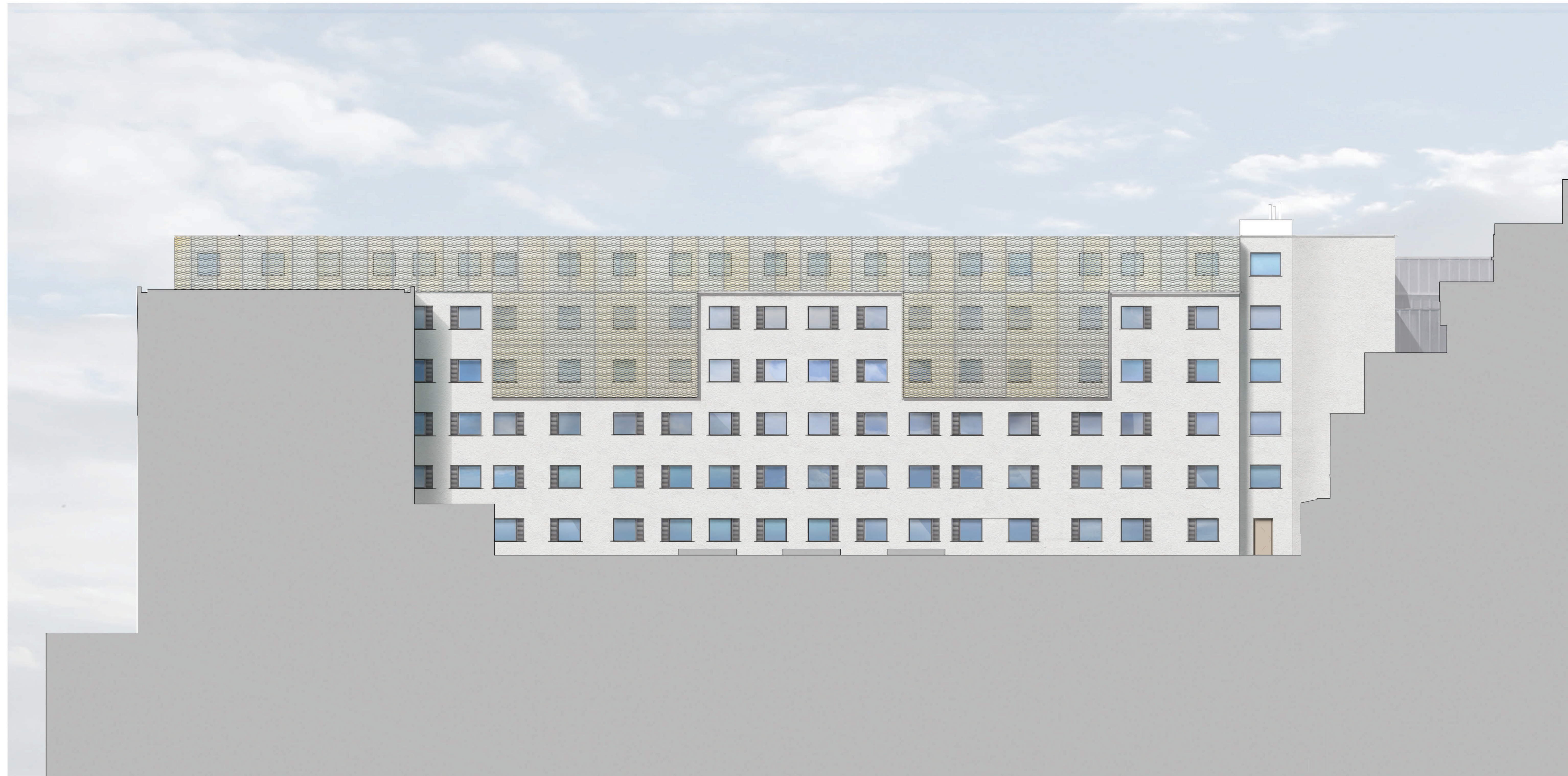
MAIN COURTYARD ELEVATION