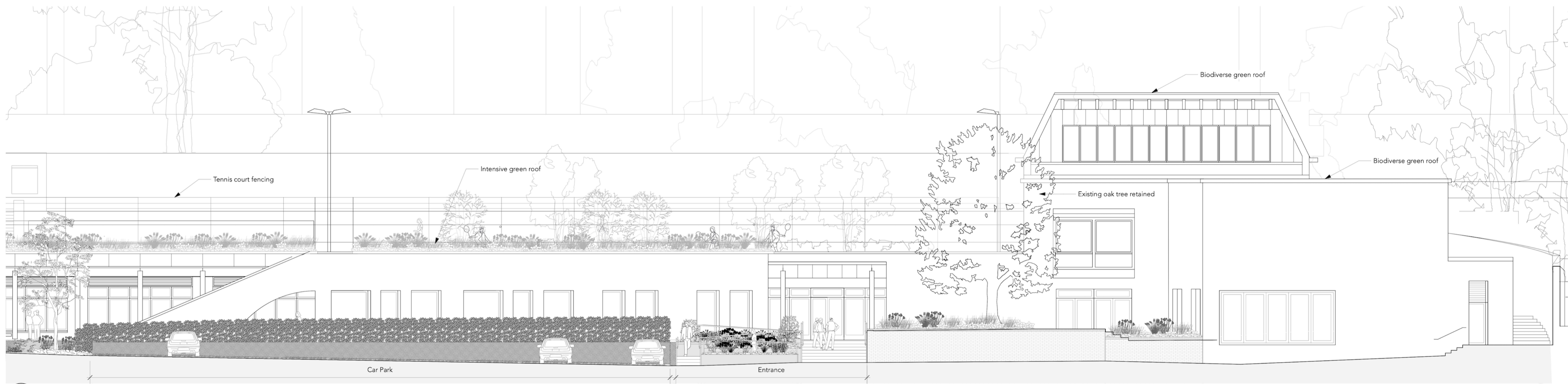
2 Elevation - South Scale: 1:100