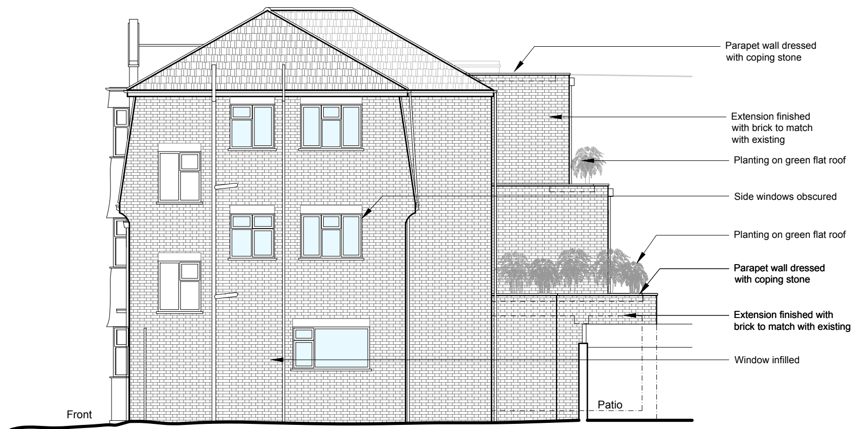
Flats - Side Elevation As Proposed 1:100