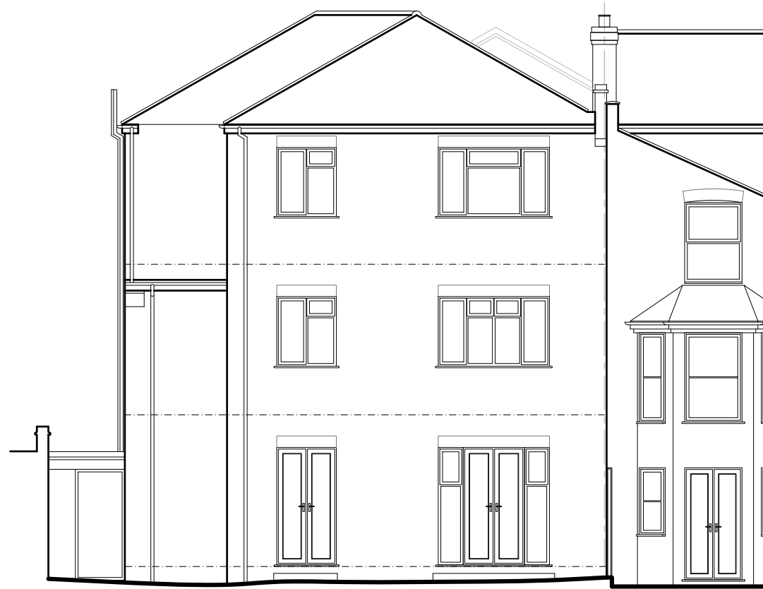
Rear Elevation As Existing 1:100