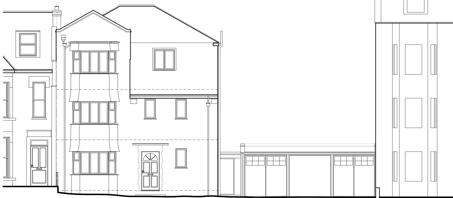
Front Elevation As Existing 1:100