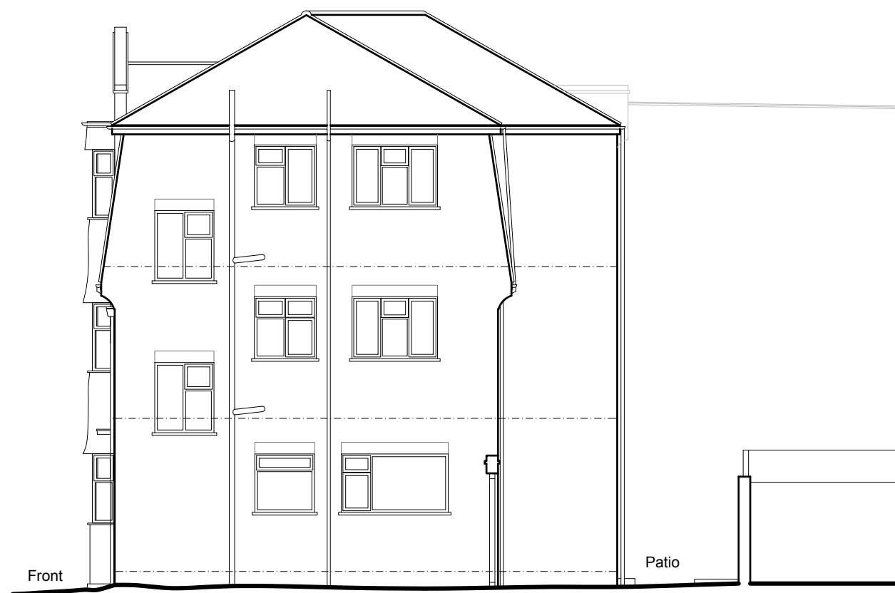
Side Elevation As Existing 1:100