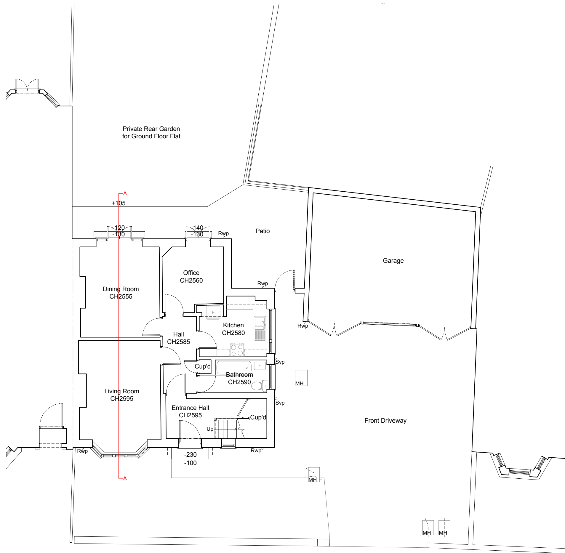
Ground Floor Plan As Existing 1:100