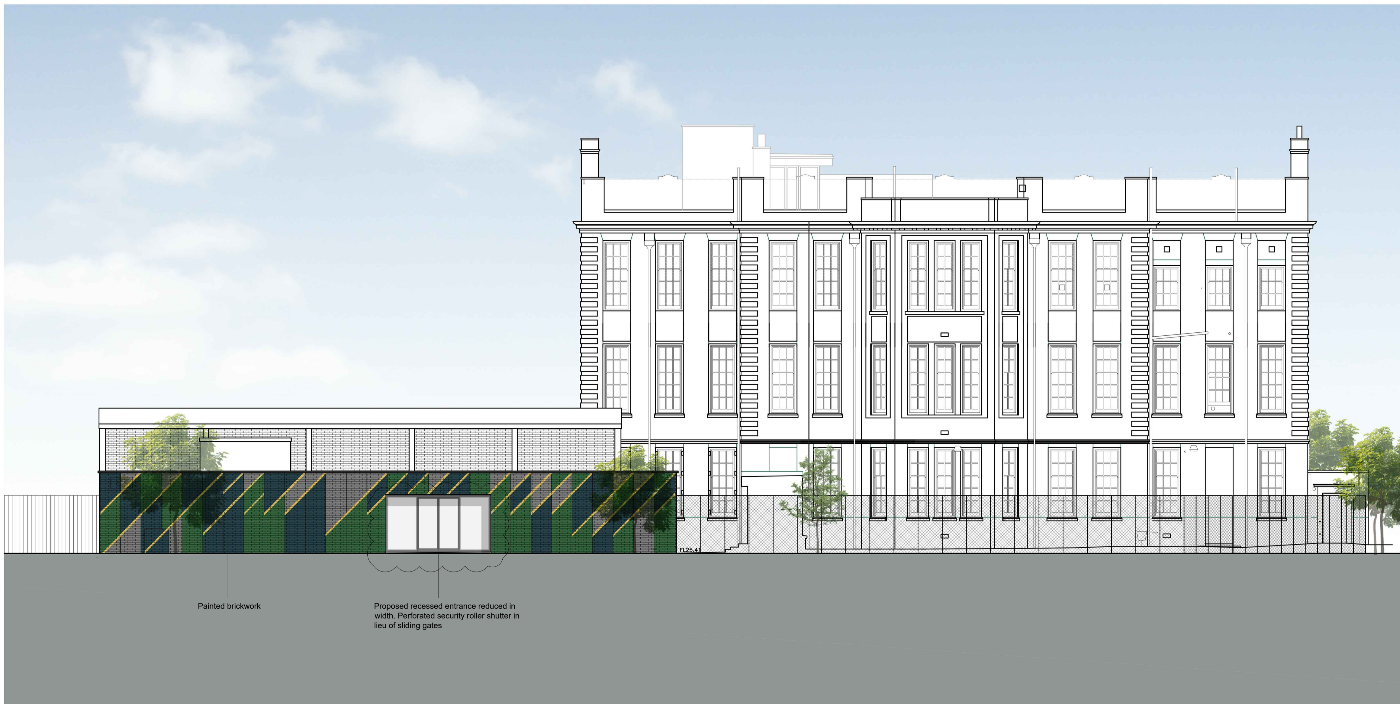
01 PROPOSED COMMUNITY HALL ELEVATION 1:100