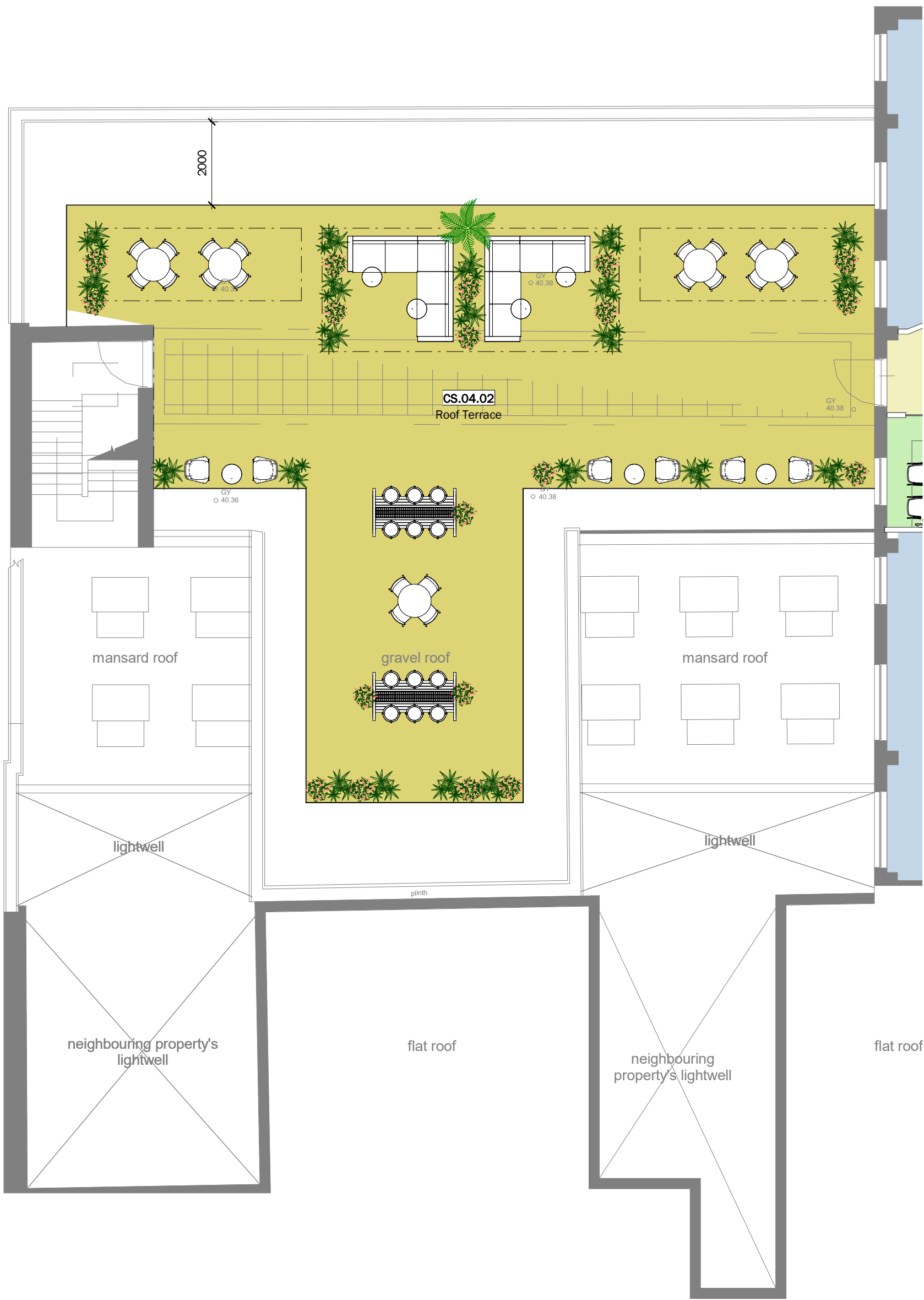
1 Level 04 Terrace 1 : 100