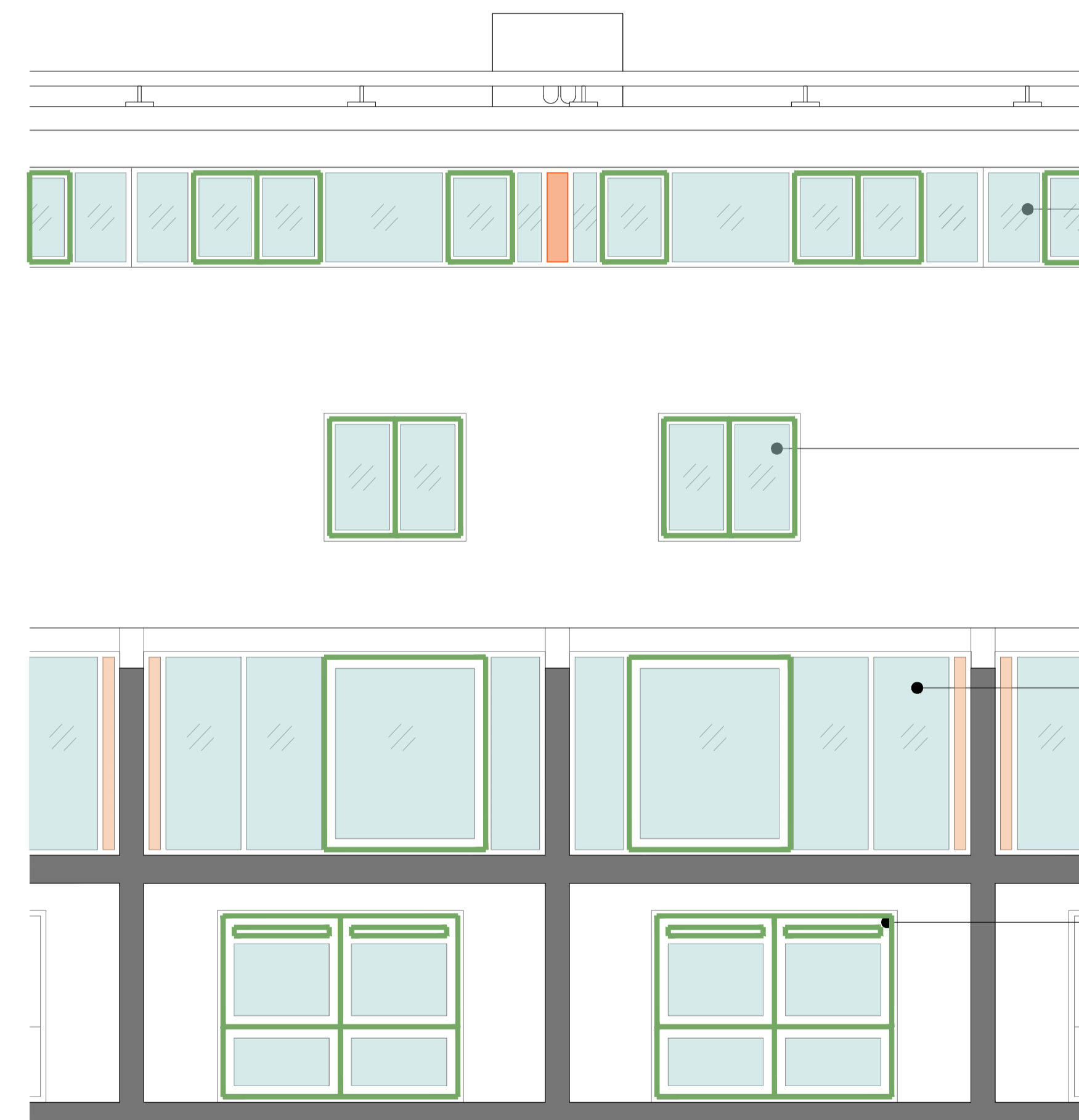
02 Block B - Proposed South Elevation - Cut-Away 1:50

NOTE: Arrangement replicated every 2 bays along Typical Elevations of Blocks B1 to B3