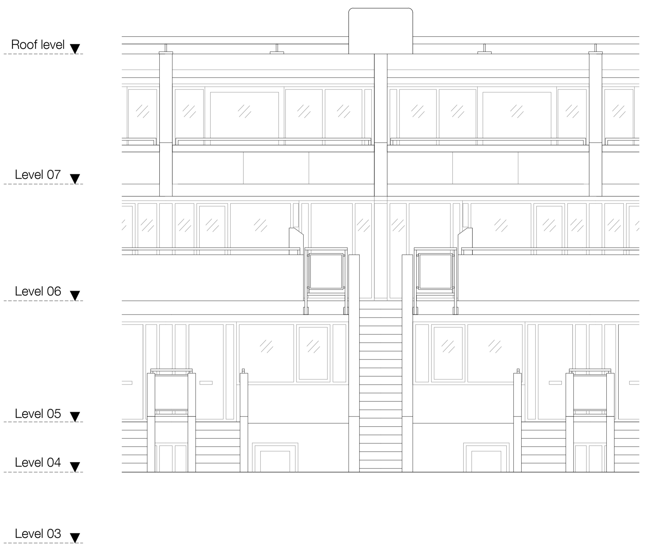
01 Block B - Existing North Elevation - Typical Bay 1:50

NOTE: Arrangement replicated every 2 bays along Typical Elevations of Blocks B1 to B3