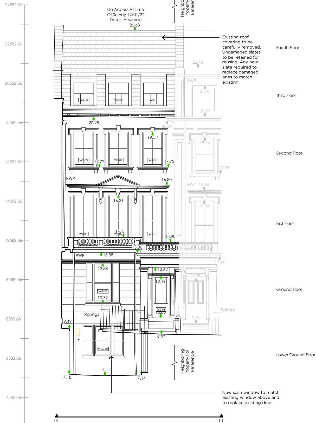
ELEVATION 1 (FRONT)