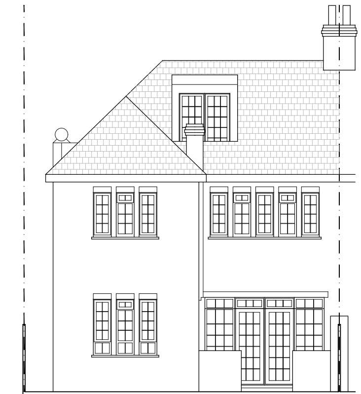
REAR ELEVATION (existing)