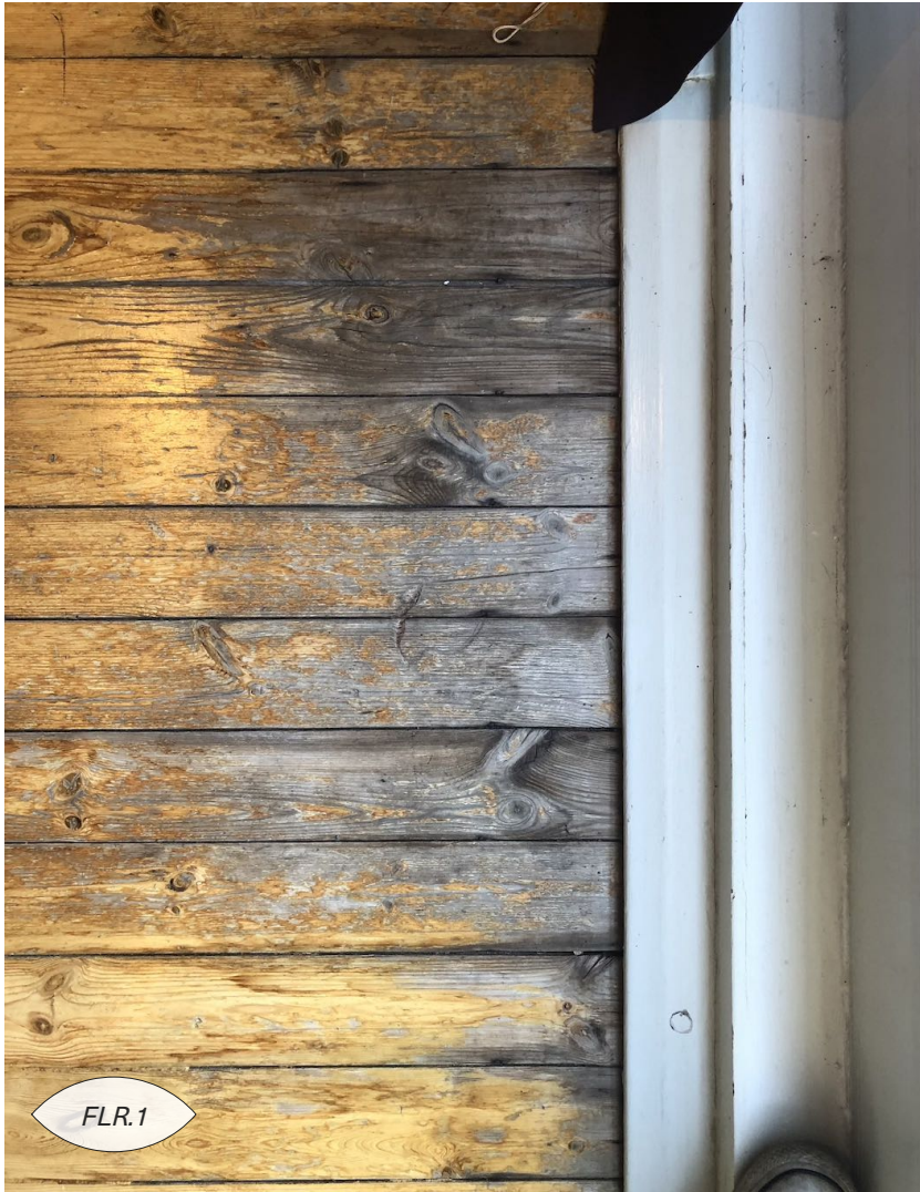
View of the existing condition to the second floor threshold area to balcony - water damage