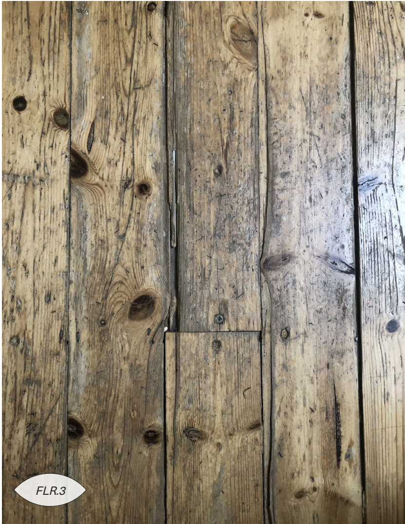
View of the existing condition to the second floor hallway