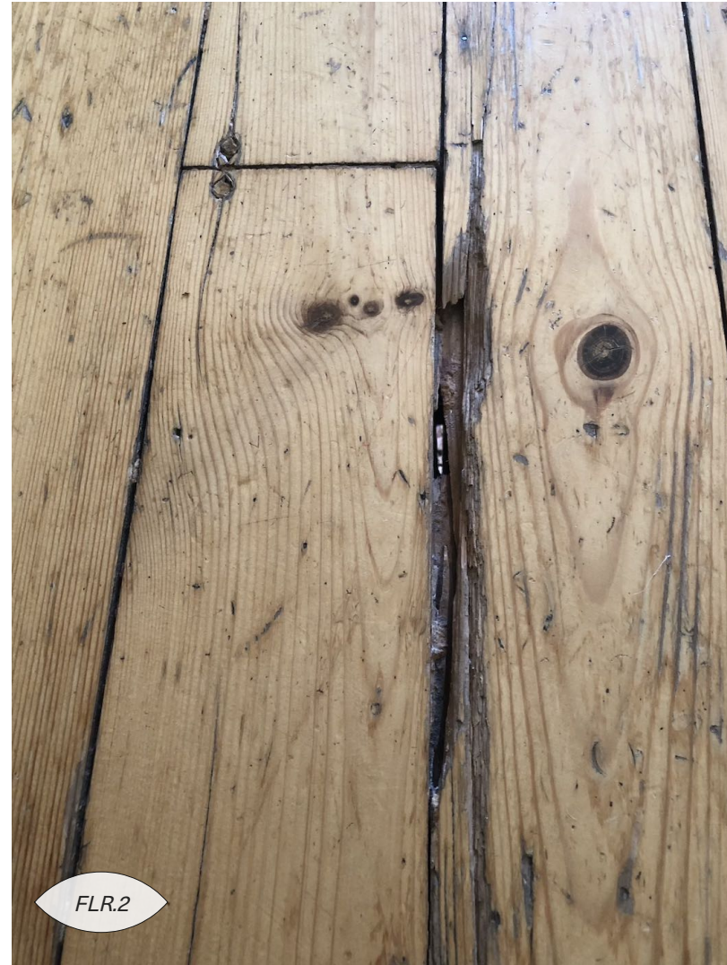
View of the existing Second Floor timber floor viewed the bedroom - visible hole through