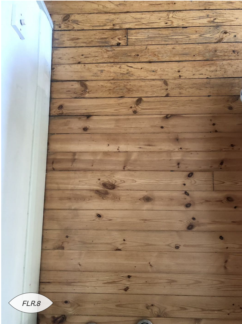
Area of previously replaced flooring to the bedroom (lower half of image)