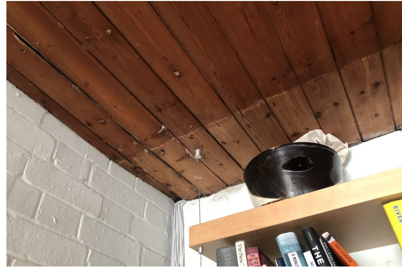
View of the existing First Floor ceiling - water damaged areas from the bathroom above