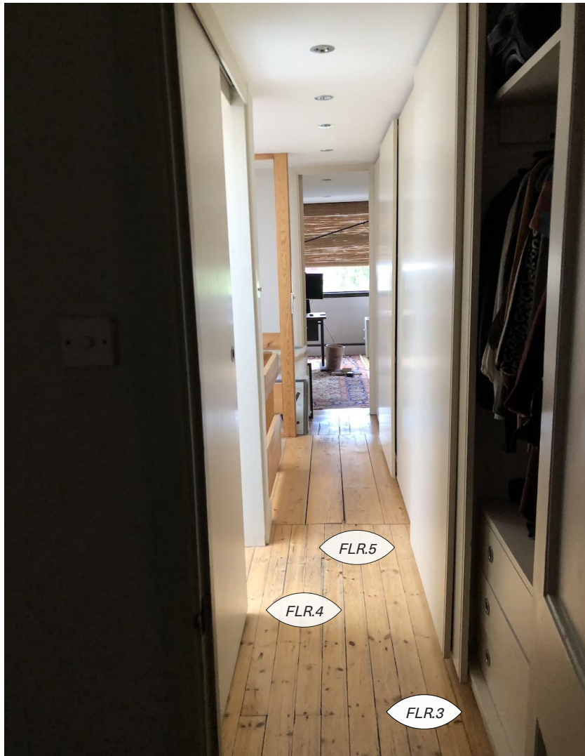
View of the existing Second Floor timber floor viewed from the Rear Elevation Bedroom.