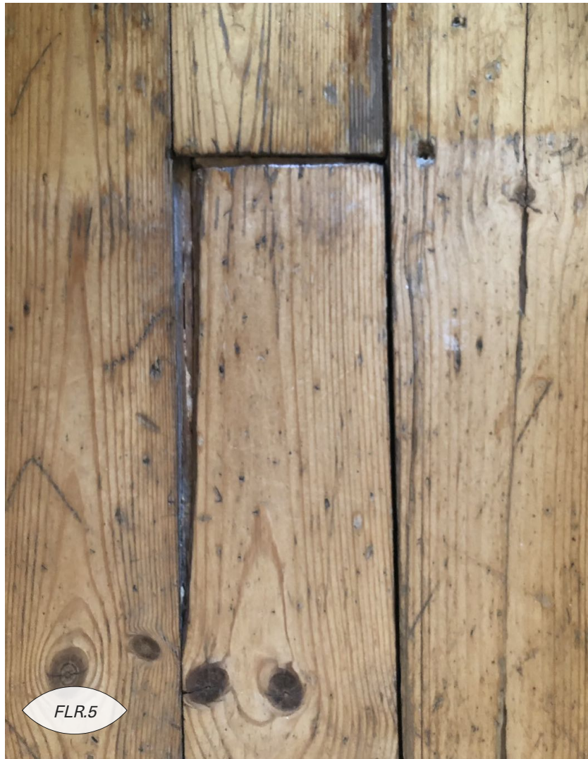
View of the existing condition to the second floor hallway