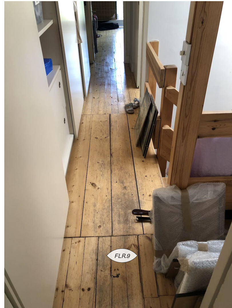
View of the existing Second Floor timber floor viewed from the Front Elevation Study Room.