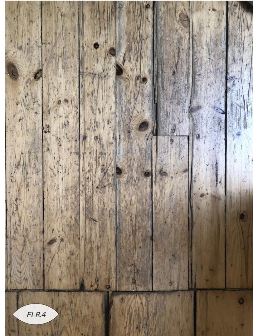
View of the existing Second Floor timber floor hallway adjacent to landing