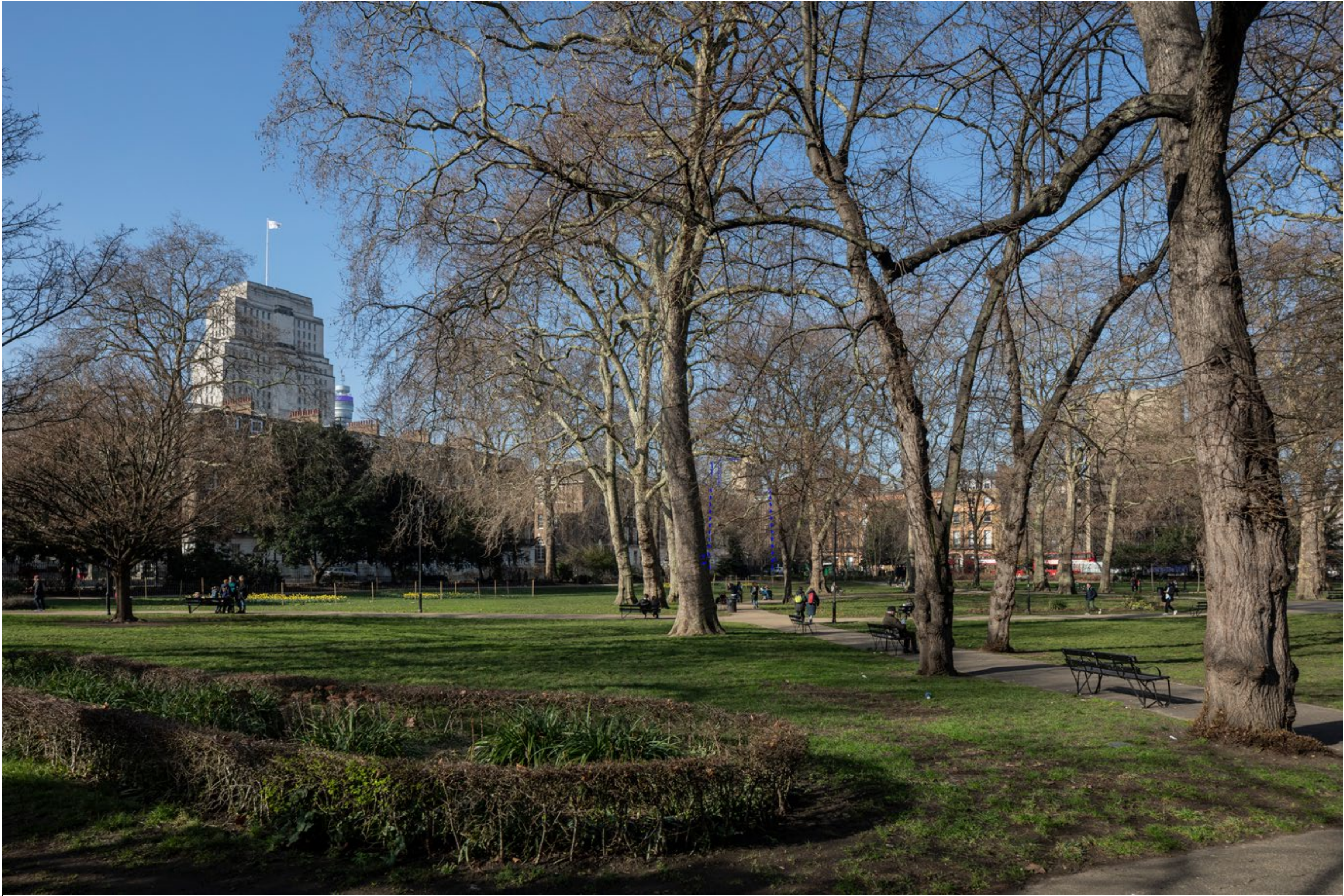
24mm – 36.9° 35mm – 27.2° 50mm – 19.8° Image scalling factor = 37% at A3, 105% at A0 50mm – 19.8° 35mm – 27.2° 24mm – 36.9°