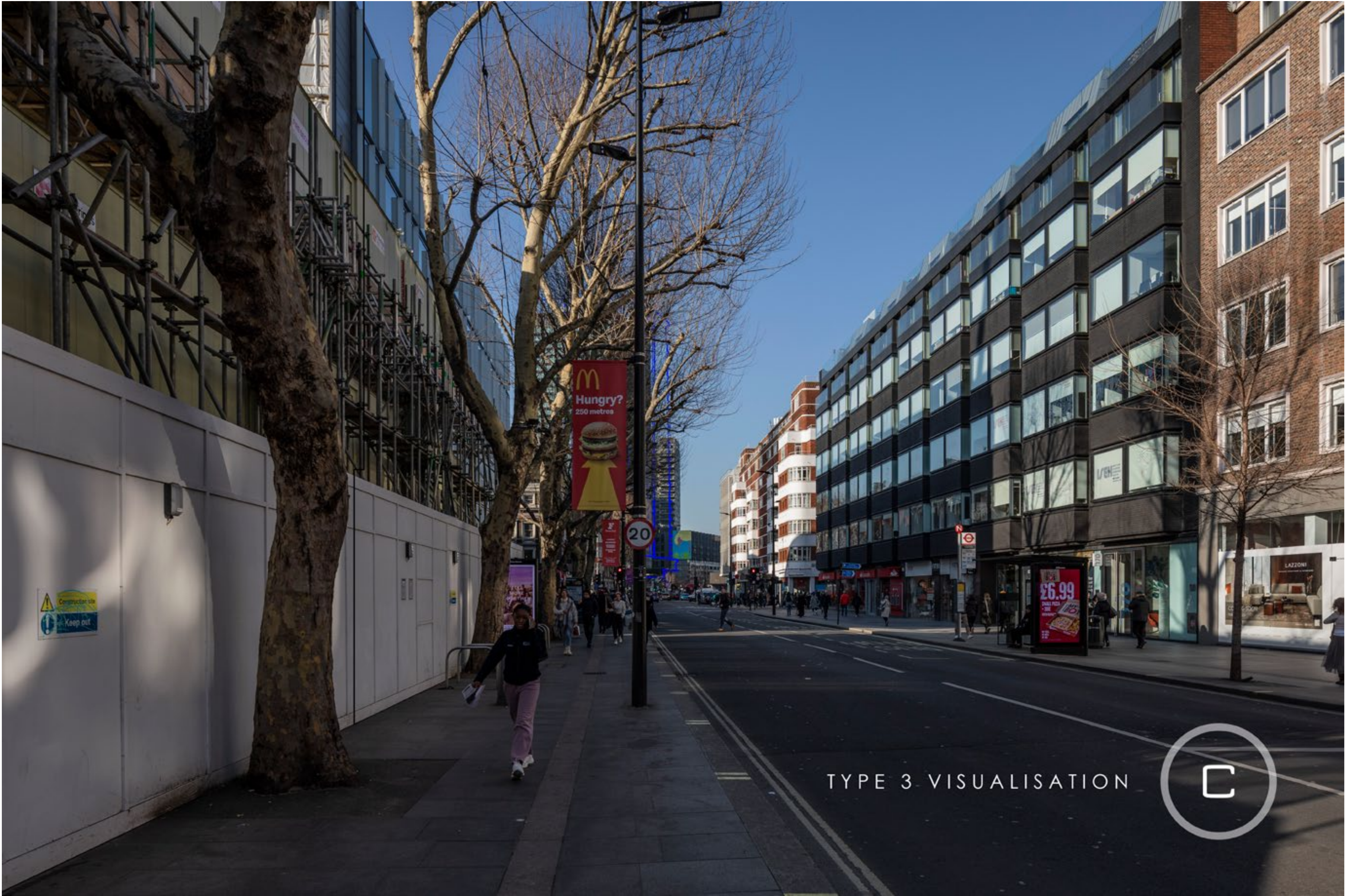
24mm – 36.9° 35mm – 27.2° 50mm – 19.8° Image scalling factor = 37% at A3, 105% at A0 50mm – 19.8° 35mm – 27.2° 24mm – 36.9°