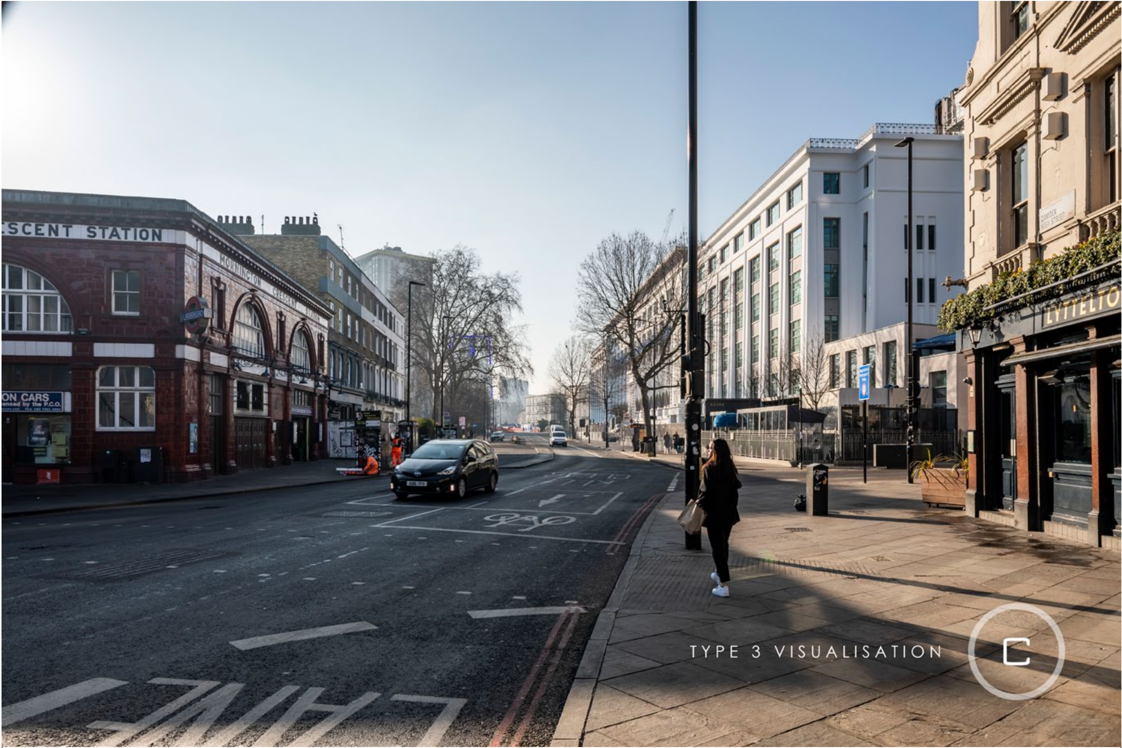
24mm – 36.9° 35mm – 27.2° 50mm – 19.8° Image scalling factor = 37% at A3, 105% at A0 50mm – 19.8° 35mm – 27.2° 24mm – 36.9°