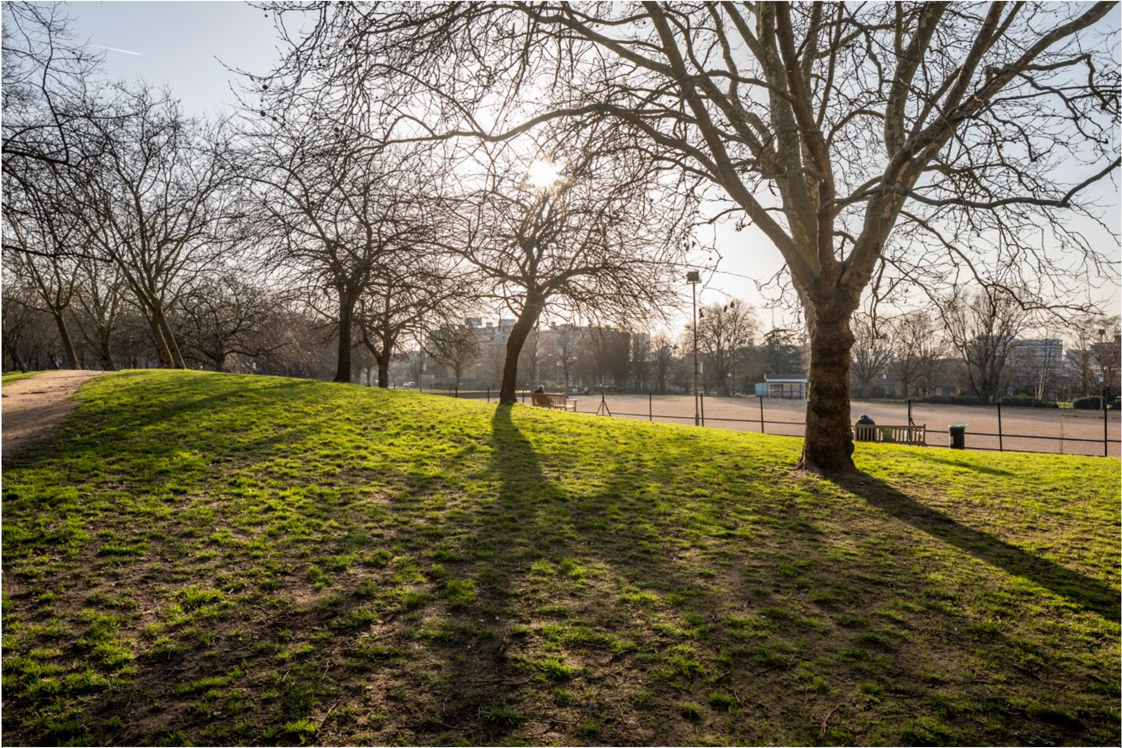
24mm – 36.9° 35mm – 27.2° 50mm – 19.8° Image scalling factor = 37% at A3, 105% at A0 50mm – 19.8° 35mm – 27.2° 24mm – 36.9°