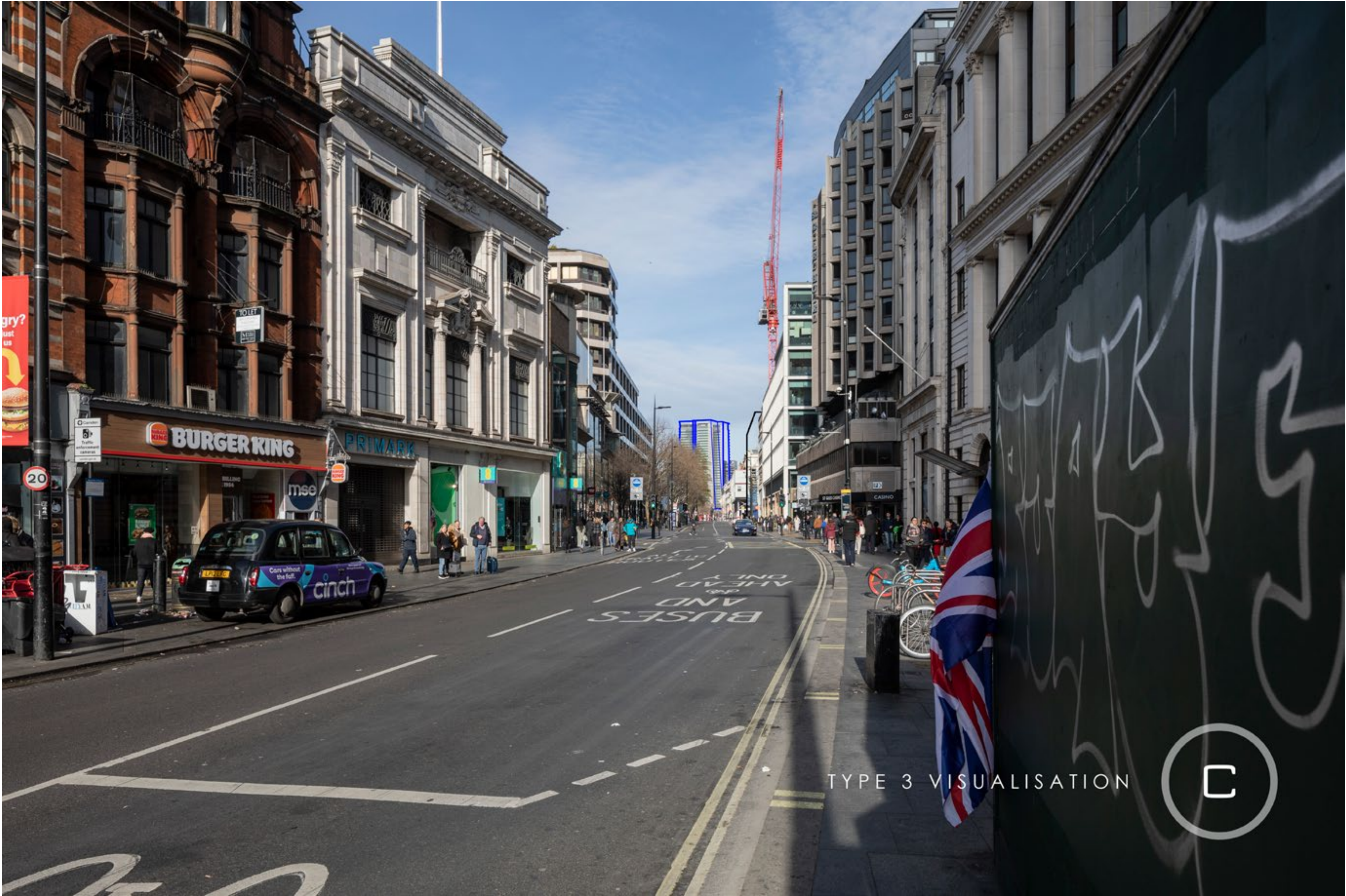
24mm – 36.9°