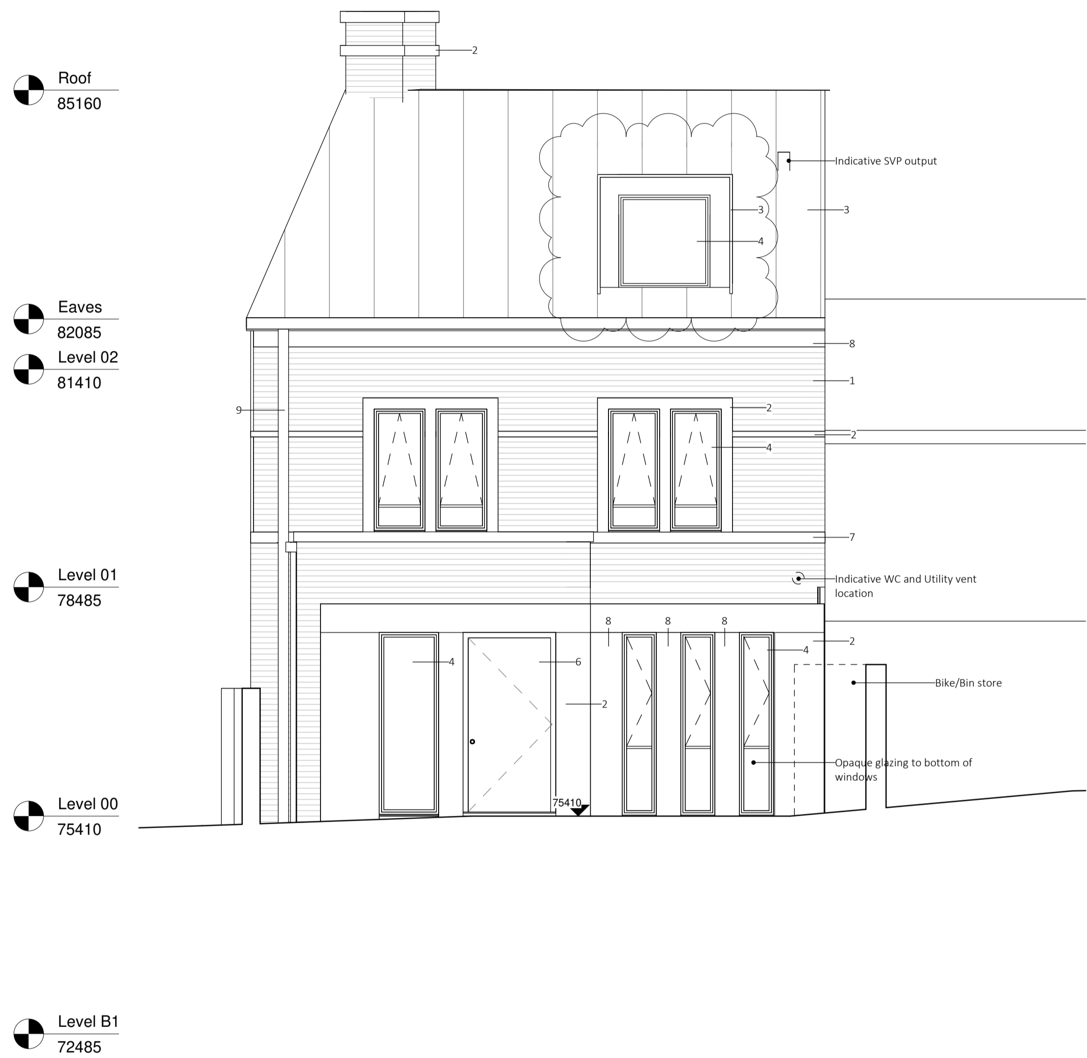
1 North Elevation 1 : 50