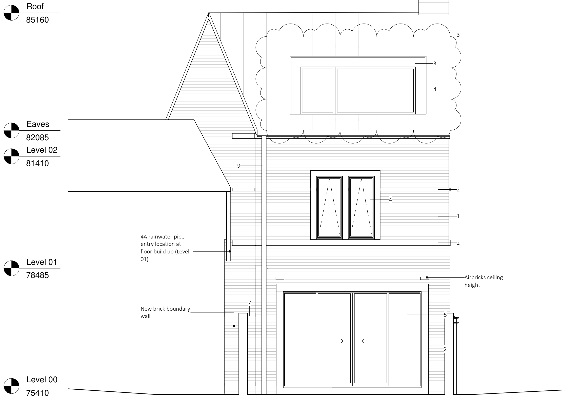
1 East Elevation 1 : 50