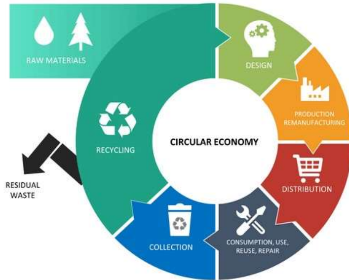
Figure 2.1 – Principles of a circular economy

The current industry and policy emphasis is a shift from the 'linear' waste economy (essentially raw materials are manufactured for a single use item before being discarded at the end of its life) to a more 'circular' economy, with the ultimate goal being Net Zero Waste.