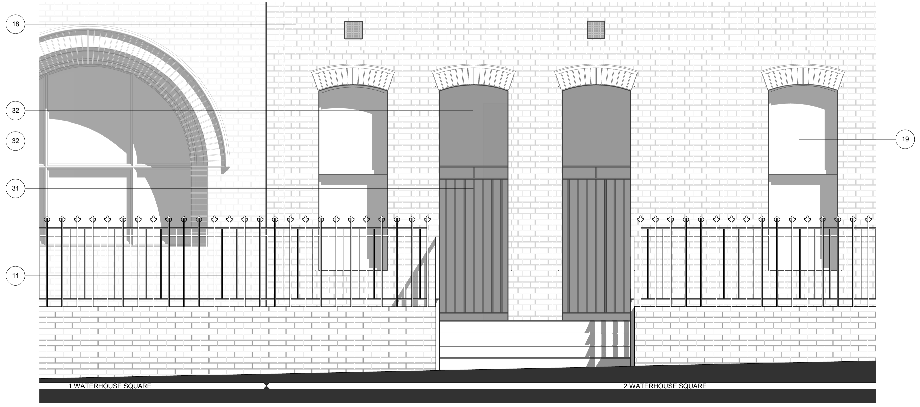
1 Planning - Proposed - R7 East Facade Scale: 1 : 25