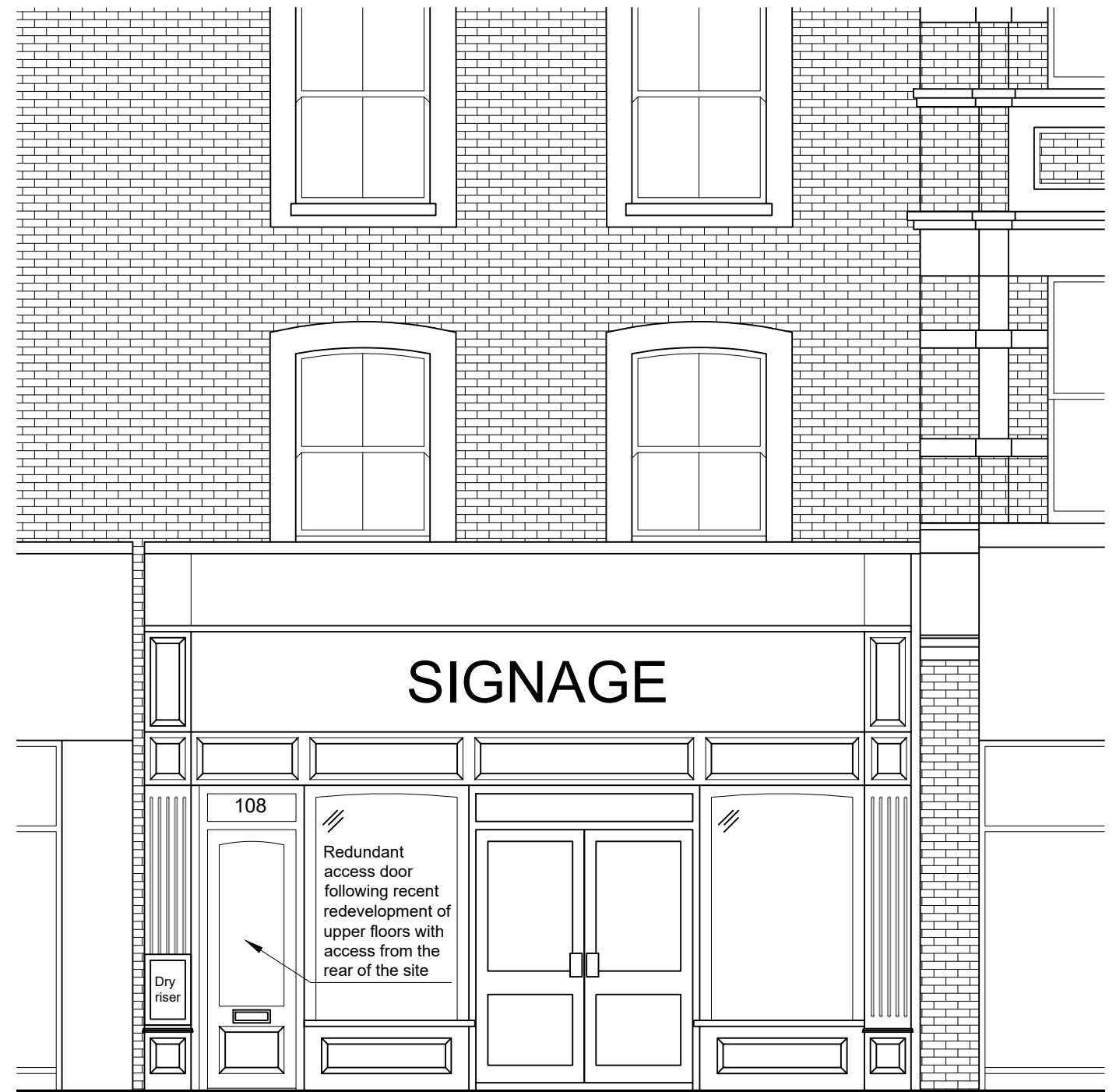
Existing Front Elevation (facing Kilburn High St.) Scale 1:50