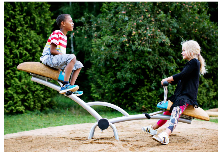
P10 Forest bugs seesaw Scale: n/a