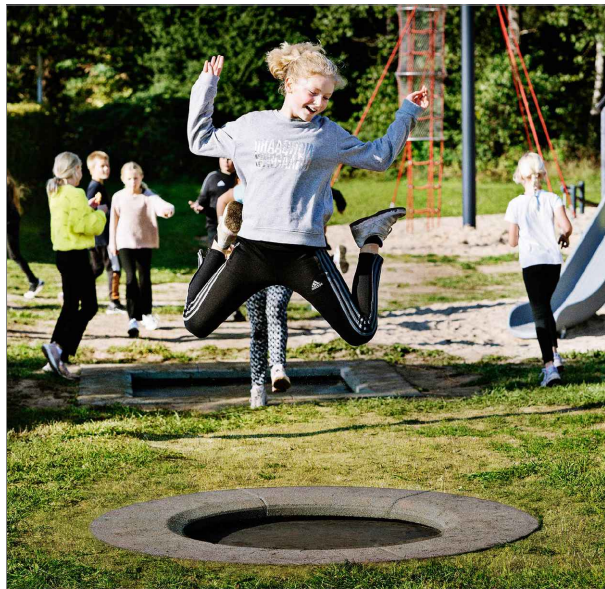
P13 Trampoline Scale: n/a