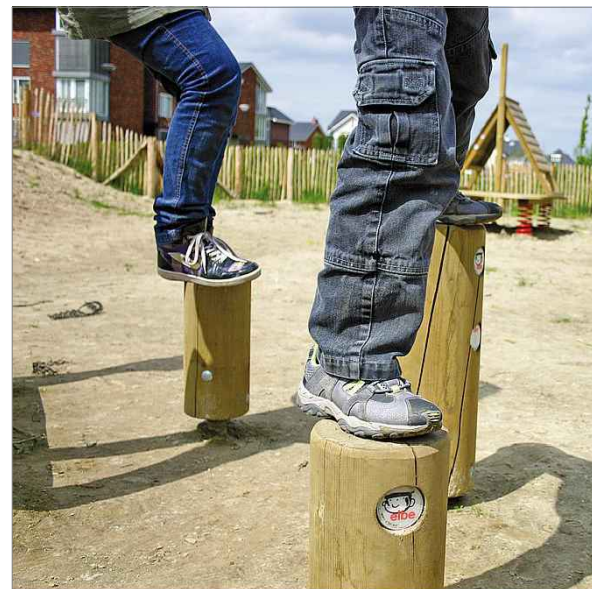
P7 Stepping logs Scale: n/a