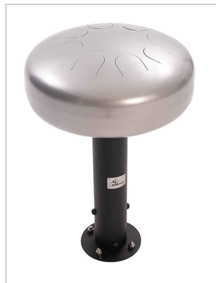
P2 Hand drum Scale: n/a