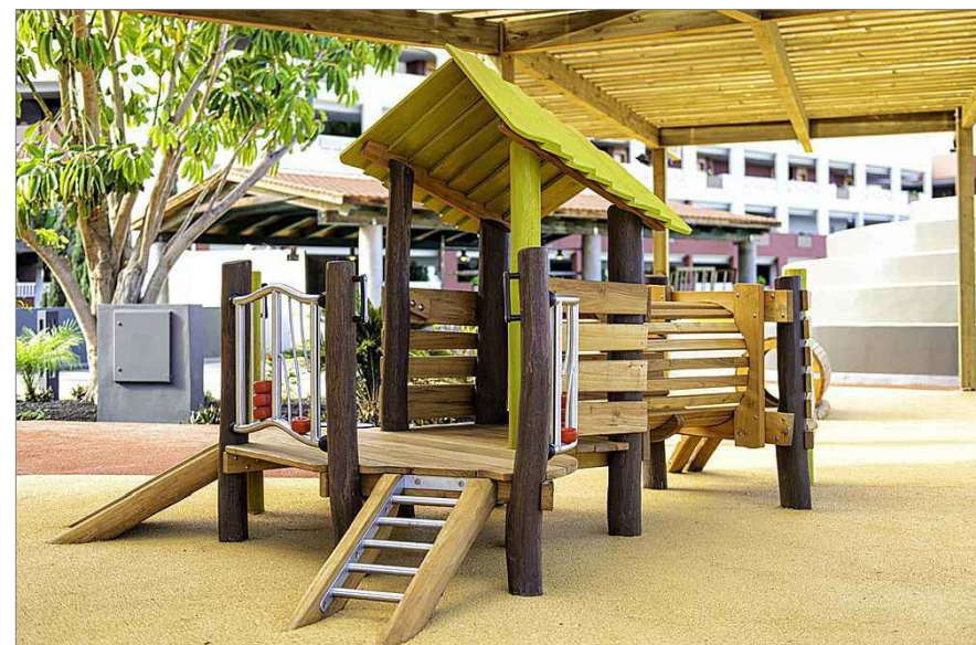
P5 Rano play unit Scale: n/a