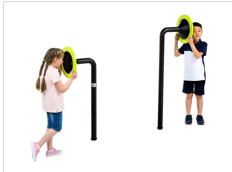
P15 Telephone tubes Scale: n/a