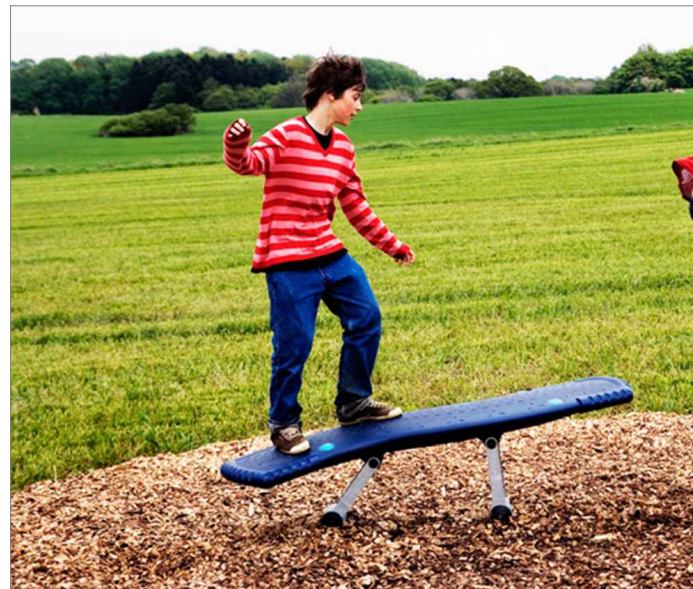
P23 Surfing board Scale: n/a