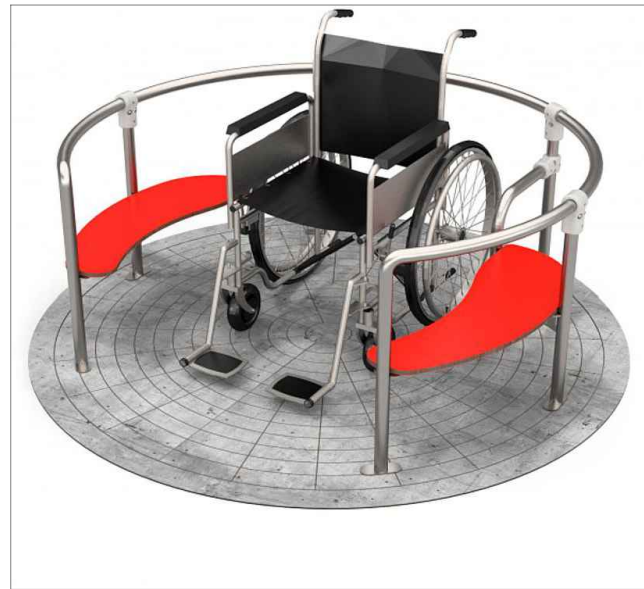
P14 Roundabout Scale: n/a