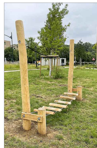
P18 Balance bridge Scale: n/a