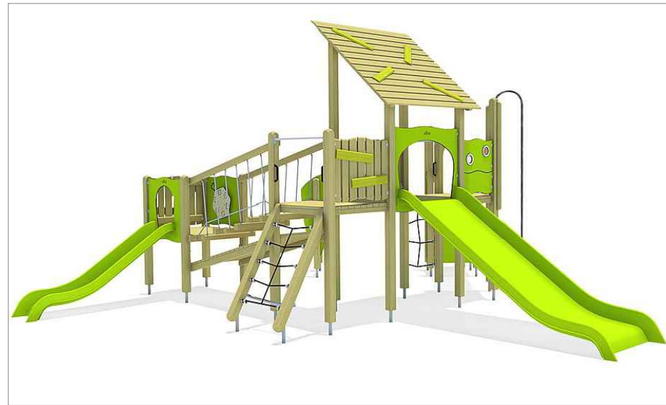
P9 Combined play structure Scale: n/a