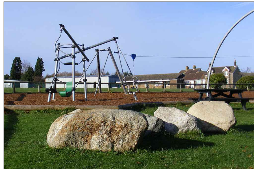
P22 Landscape boulders Scale: n/a