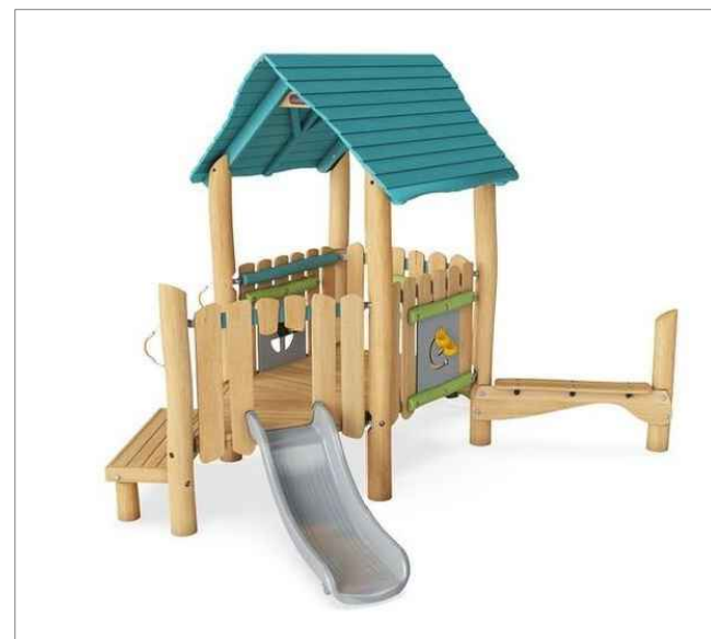
P6 Little Hen's House Scale: n/a