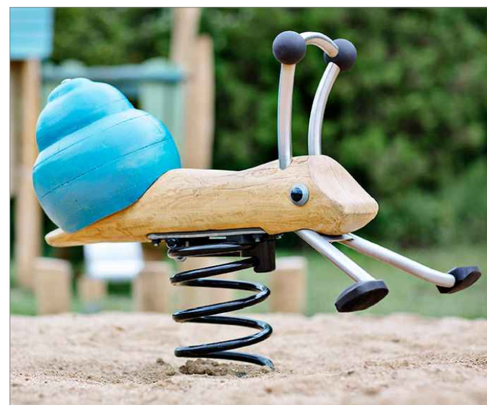
P12 Spring rocker - Snail Scale: n/a