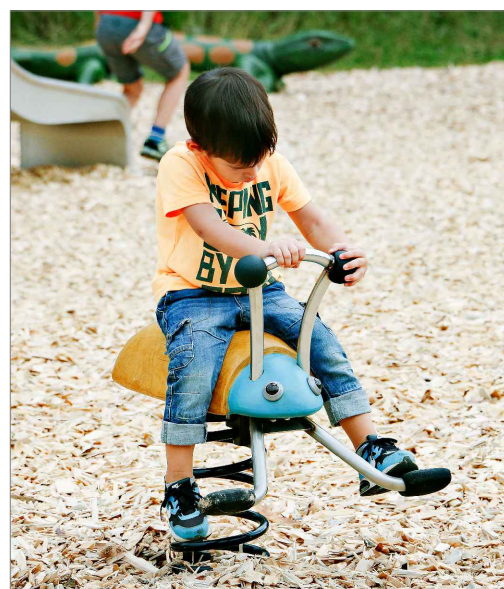
P11 Spring rocker - Forest bug Scale: n/a