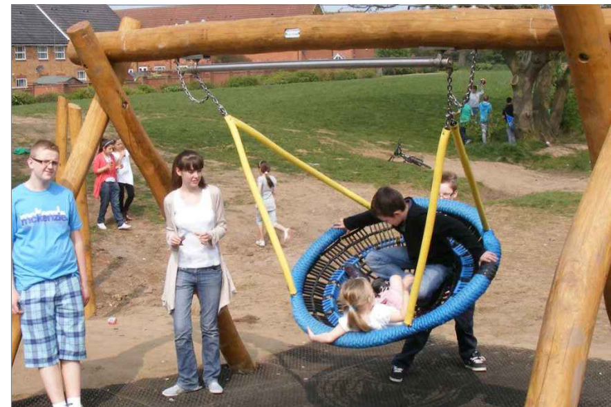
P8 Nest swing Scale: n/a