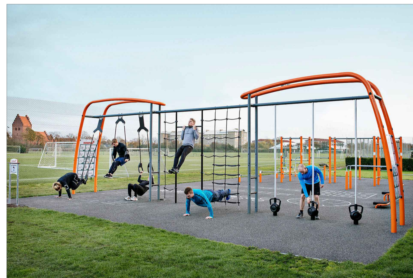
G5 Combined training set Scale: n/a