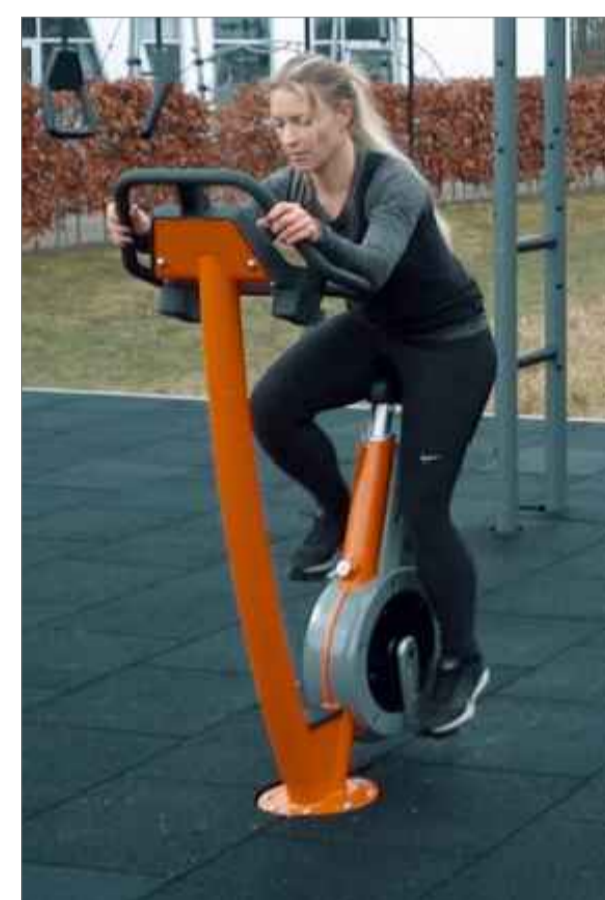
G3 Spinning bike Scale: n/a