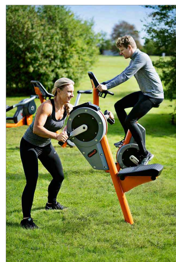
G2 Arm bike Scale: n/a