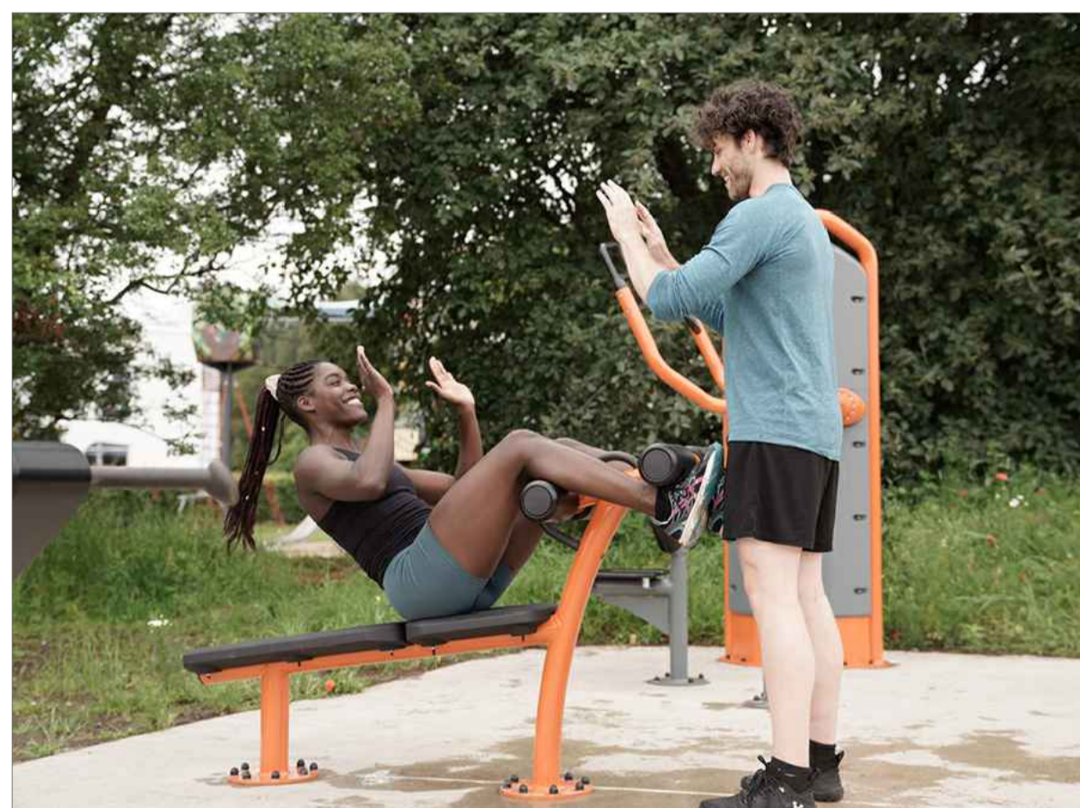
G4 Sit up bench Scale: n/a