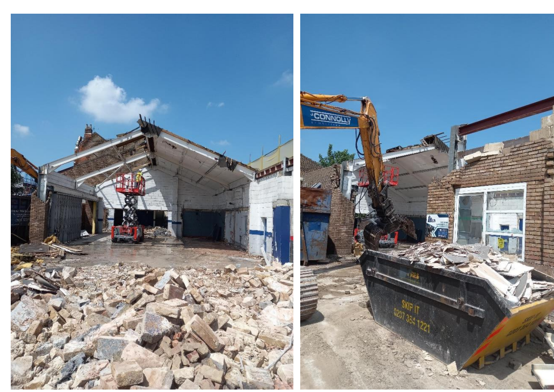
South Wall Demolition