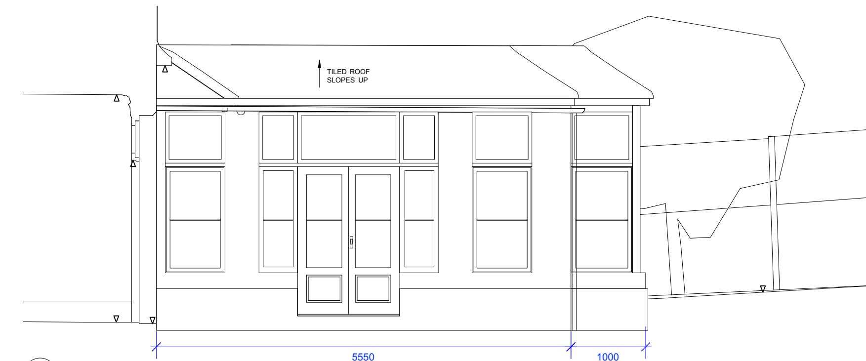
2 Side Elevation