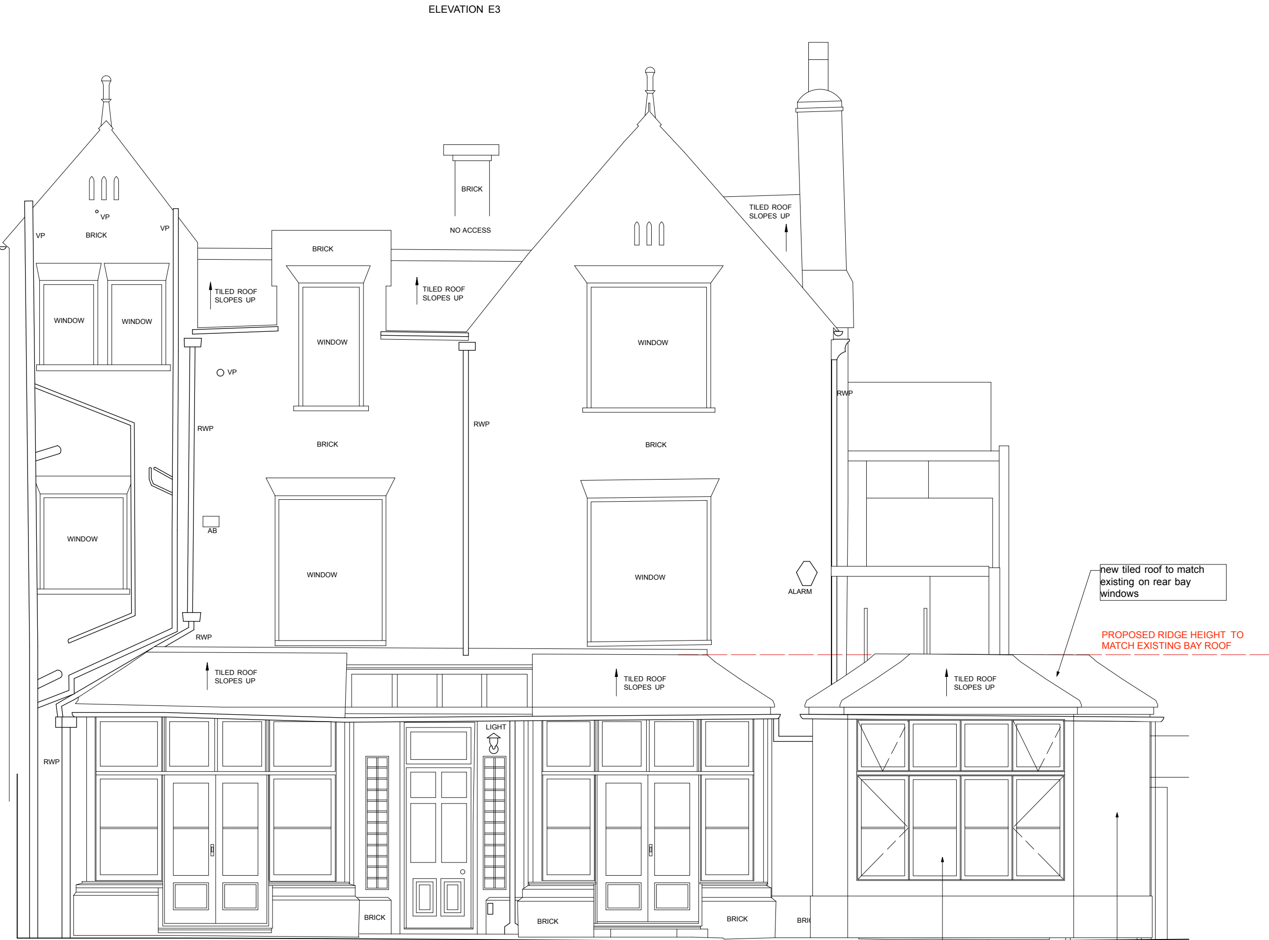
1 Rear Elevation