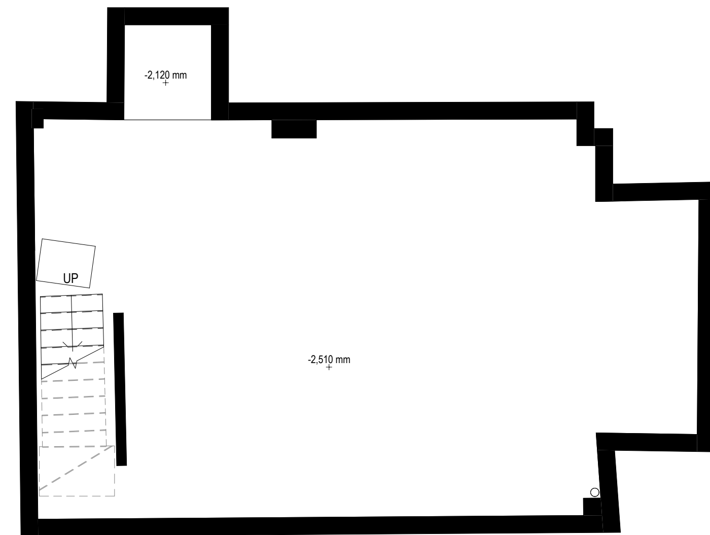
2 NEW B1 PLAN EXTERNAL PLANT 1 : 50 @ A1