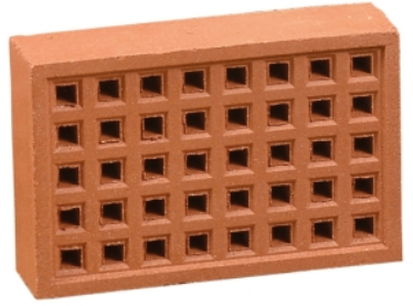
Sample image of the brick air vent. Brick to be coloured match and soot washed to match the adjoining brickwork

Existing Air bricks and vents to be removed and the facade made good