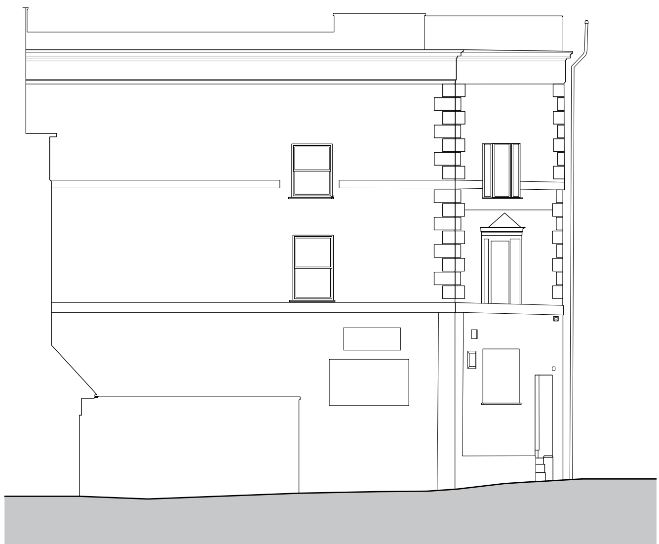
1 EXISTING ELEVATION 1