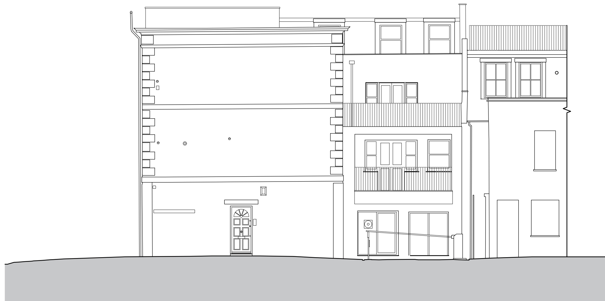
1 EXISTING ELEVATION 3