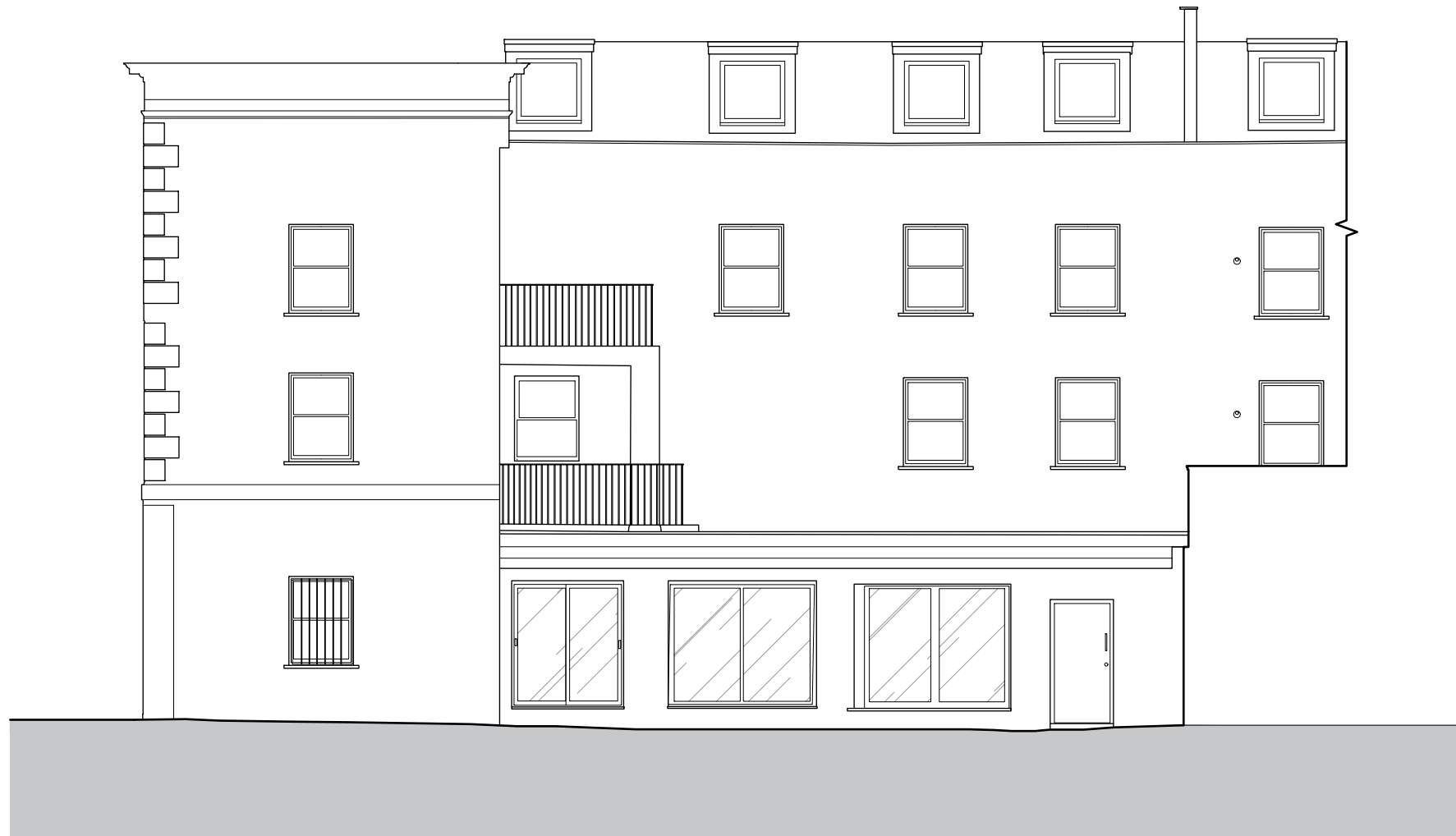
1 EXISTING ELEVATION 2