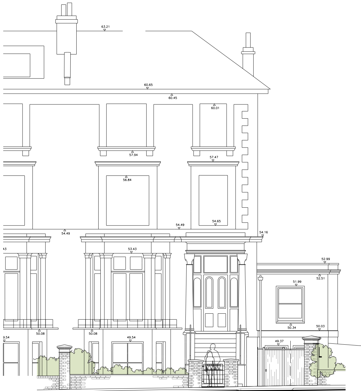
Existing 1:100 @ A3