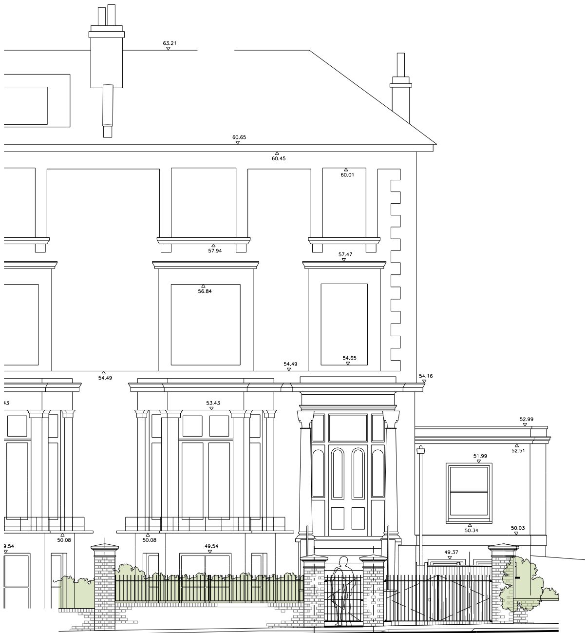
Proposed 1:100 @ A3

Primary column to define property boundaries. Re-built to match retained column height to opposite boundary in matching buff / yellow stock brick with reconstituted stone capping detail to match existing