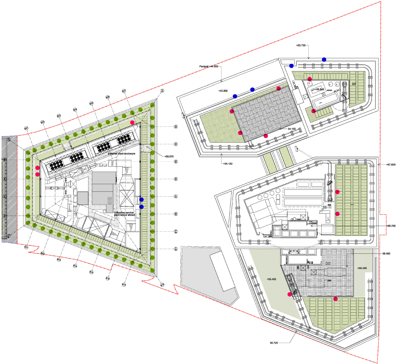
Consented Roof Plan

The Design Team has worked rigorously to ensure the additional plant required for laboratory use is configured as efficiently as possible. Only where absolutely necessary, plant enclosures have increased in plan and section.