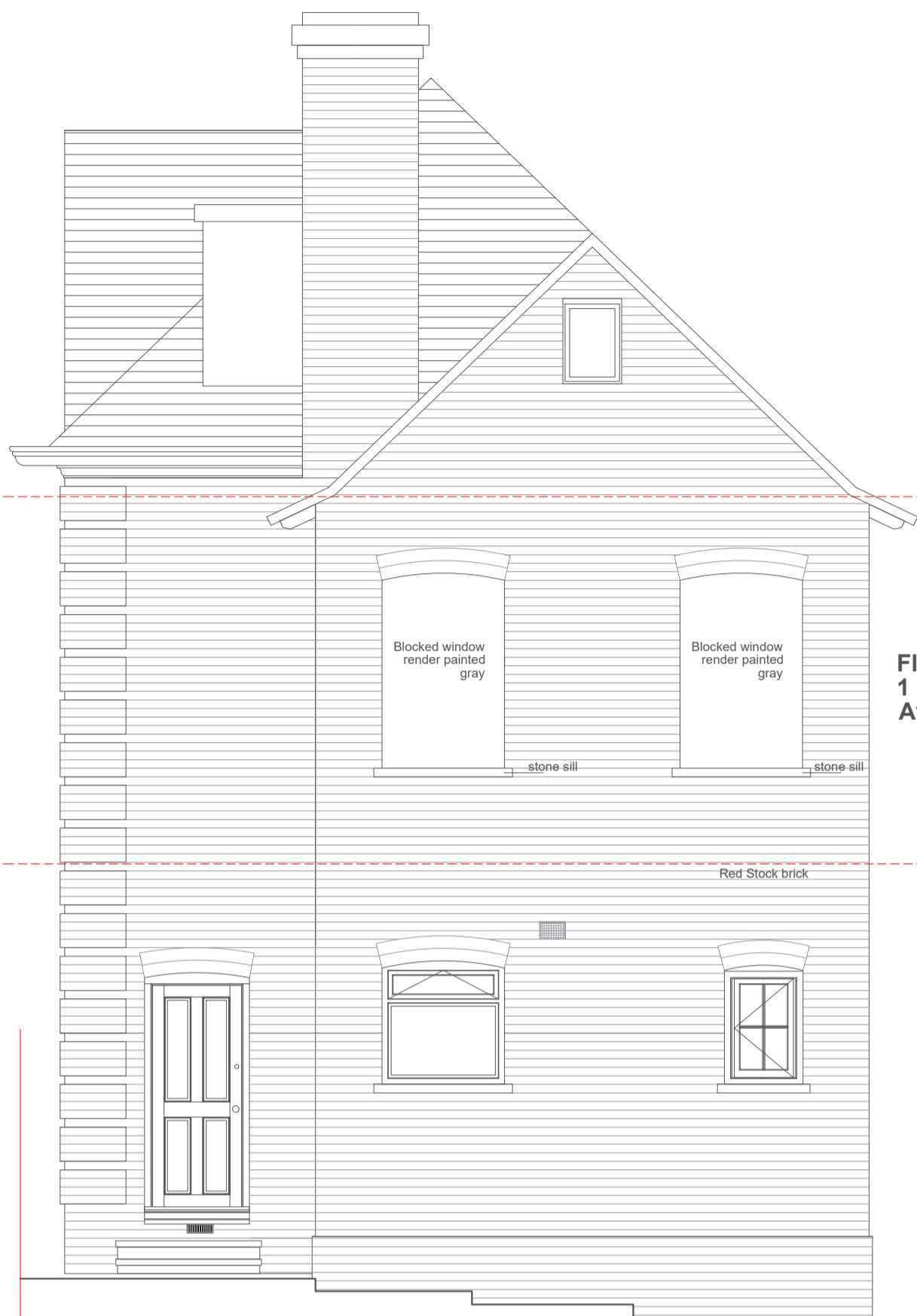
Flat 3 1 Rosecroft Avenue